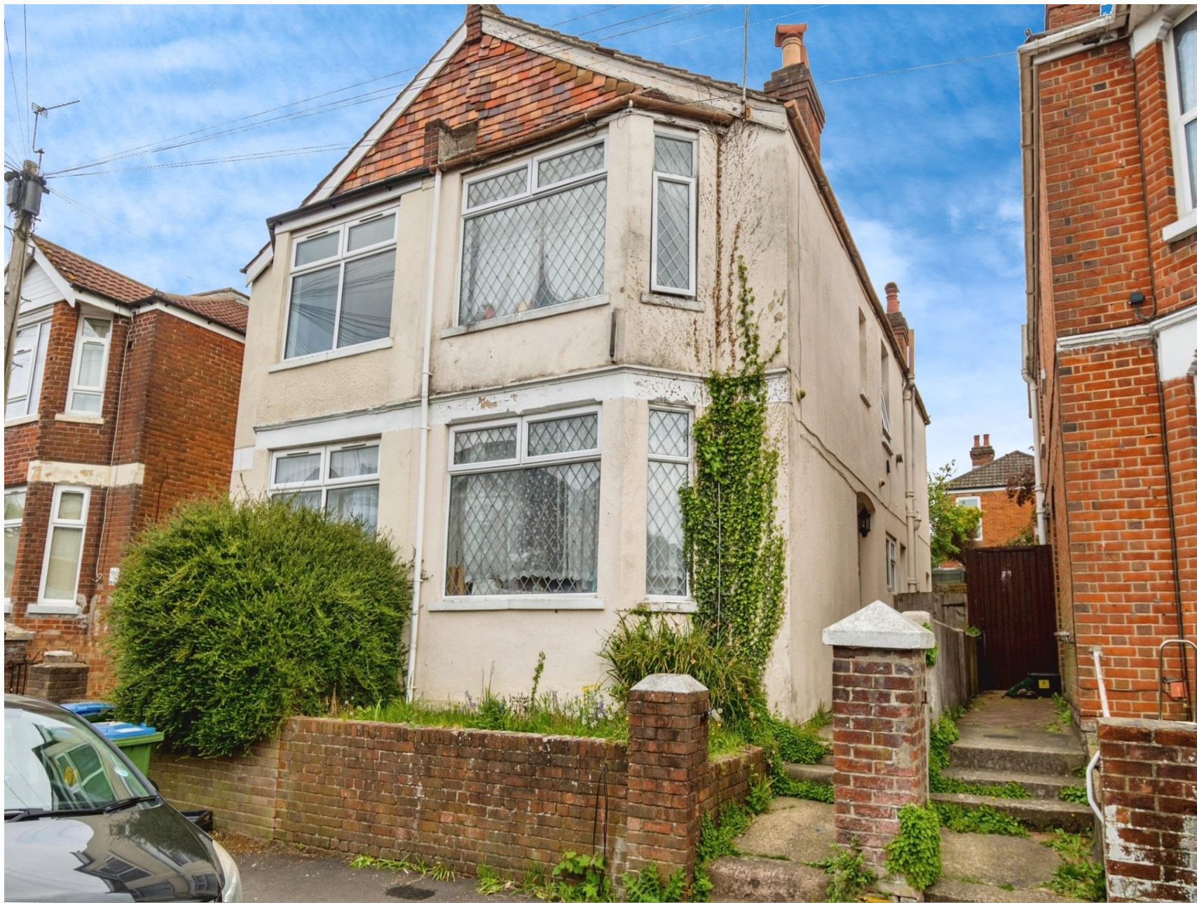
Newcombe Road, Southampton SO15 2FT