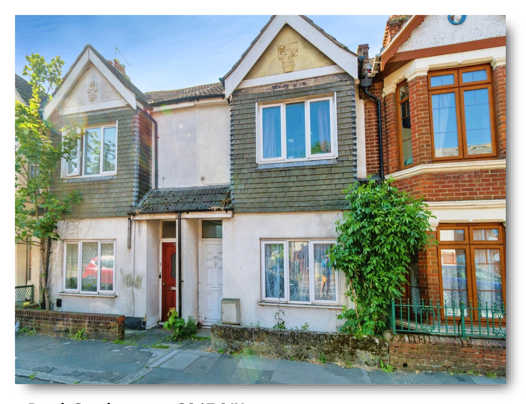
St. Denys Road, Southampton SO17 2JY