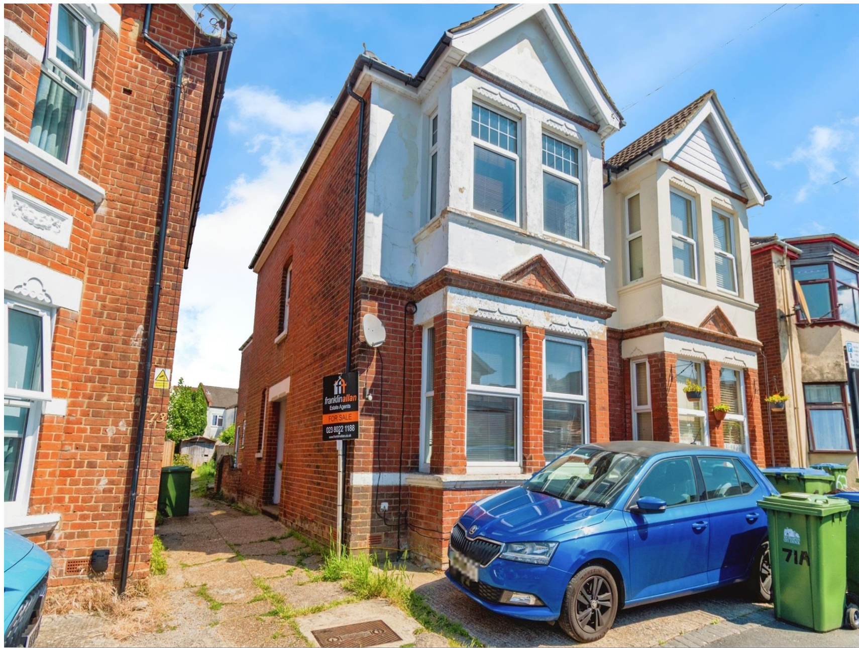
Wilton Avenue, Southampton SO15 2HB