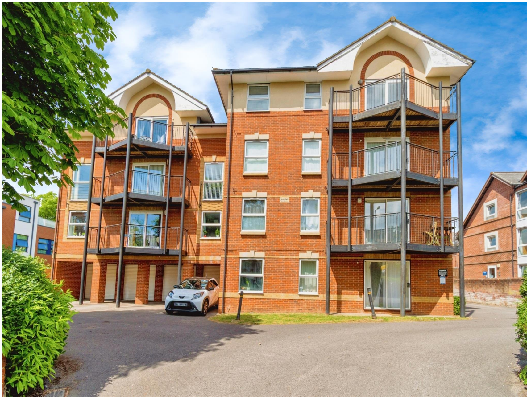
Banister Gate Archers Road, Southampton SO15 2NR