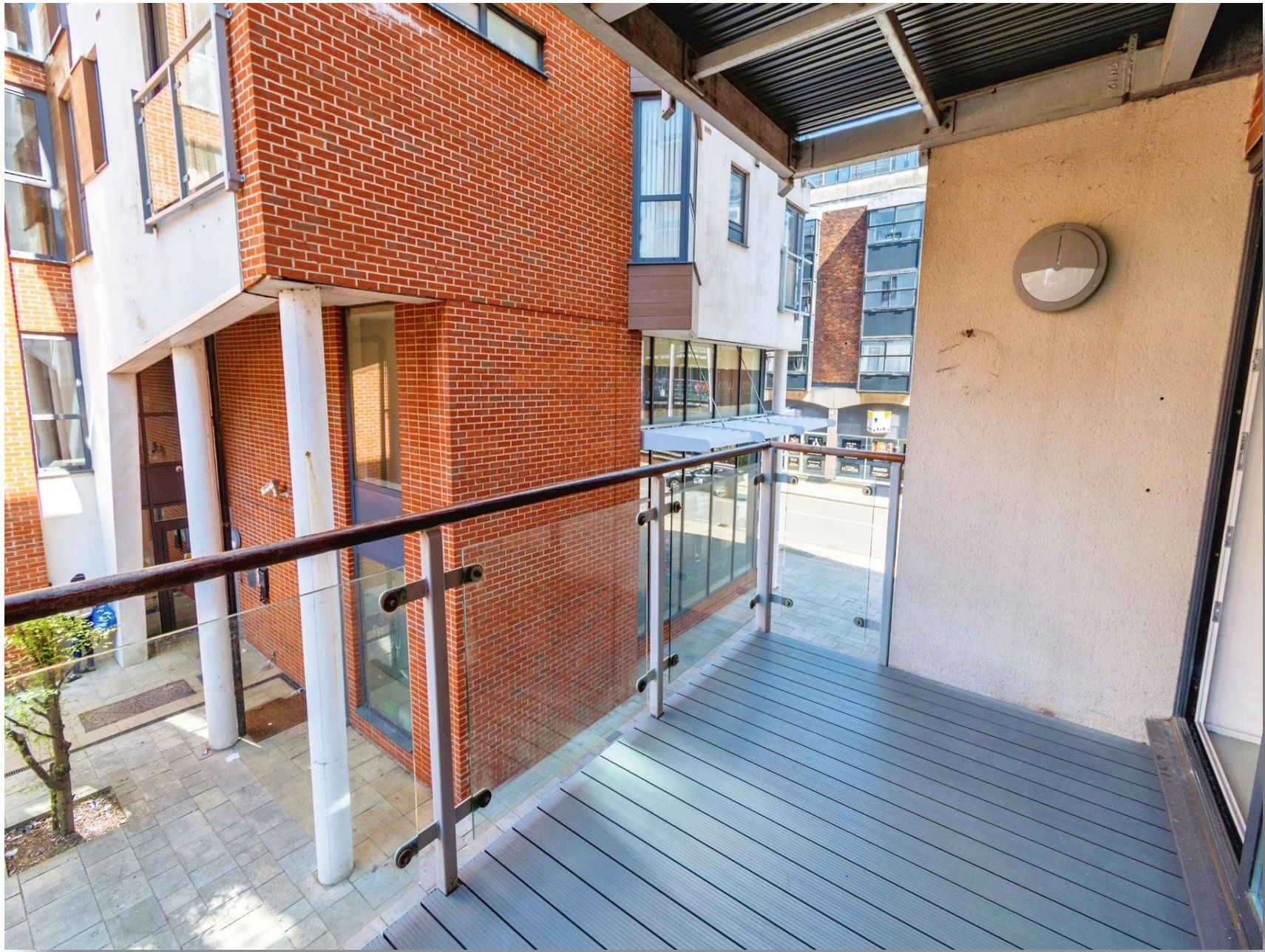
Castle Place High Street, Southampton SO14 2EA