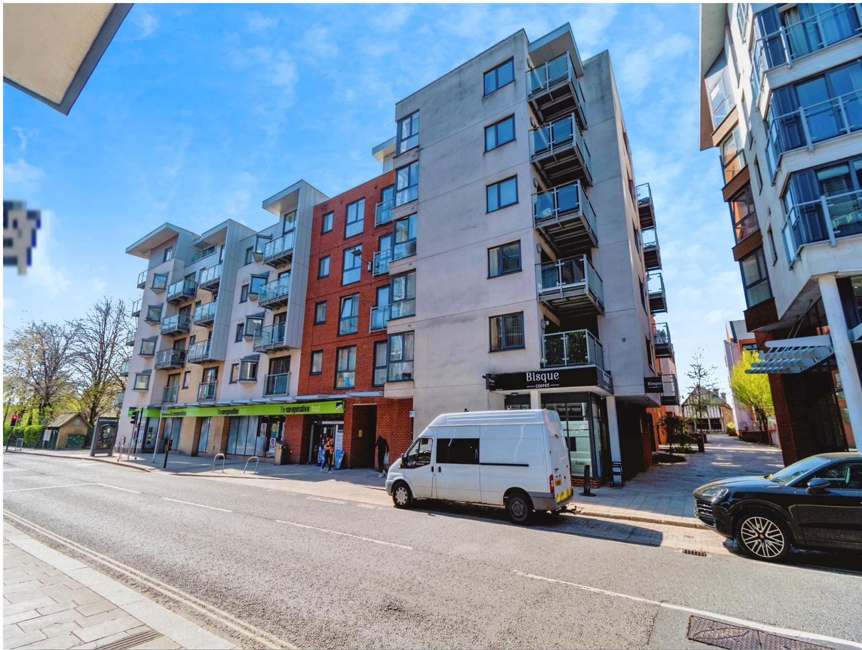
Castle Place High Street, Southampton SO14 2EA