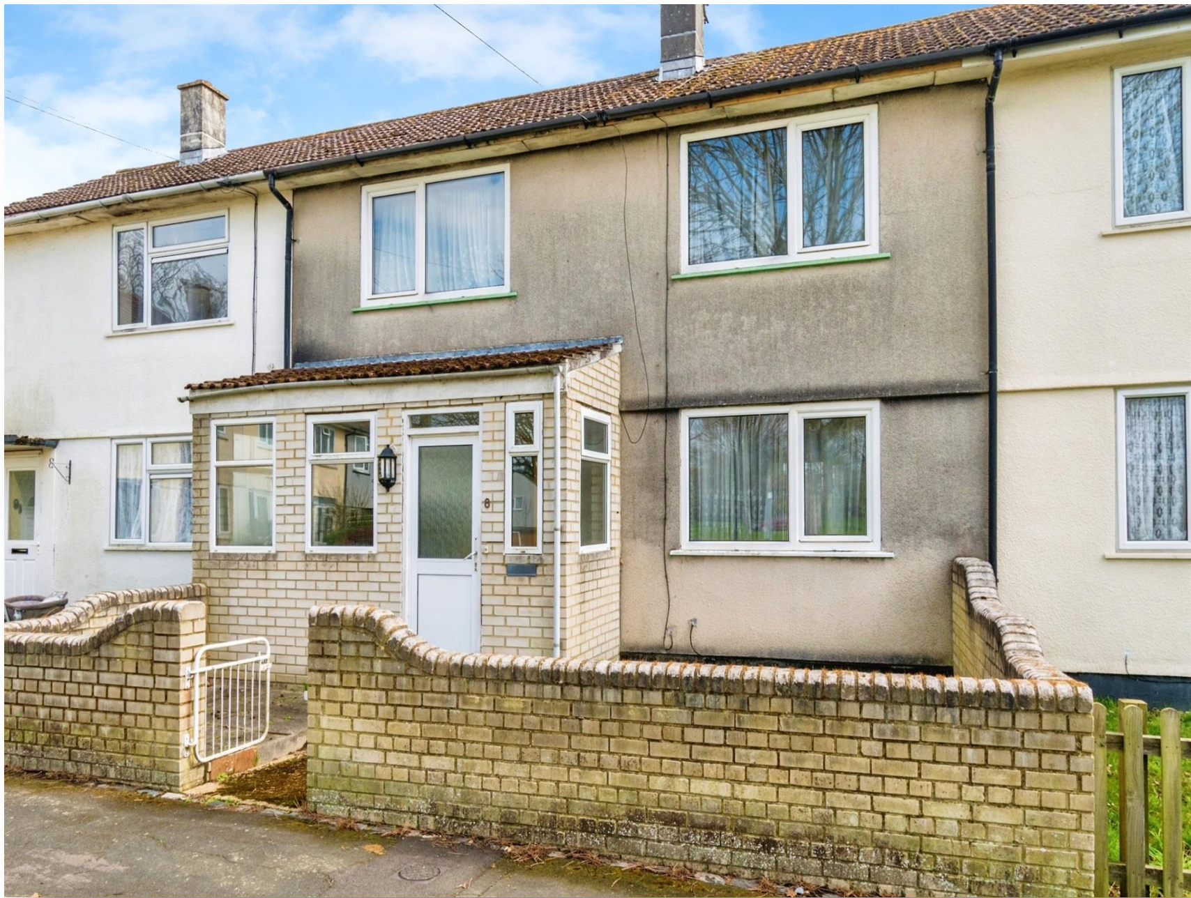
Thorness Close, Southampton SO16 9JE