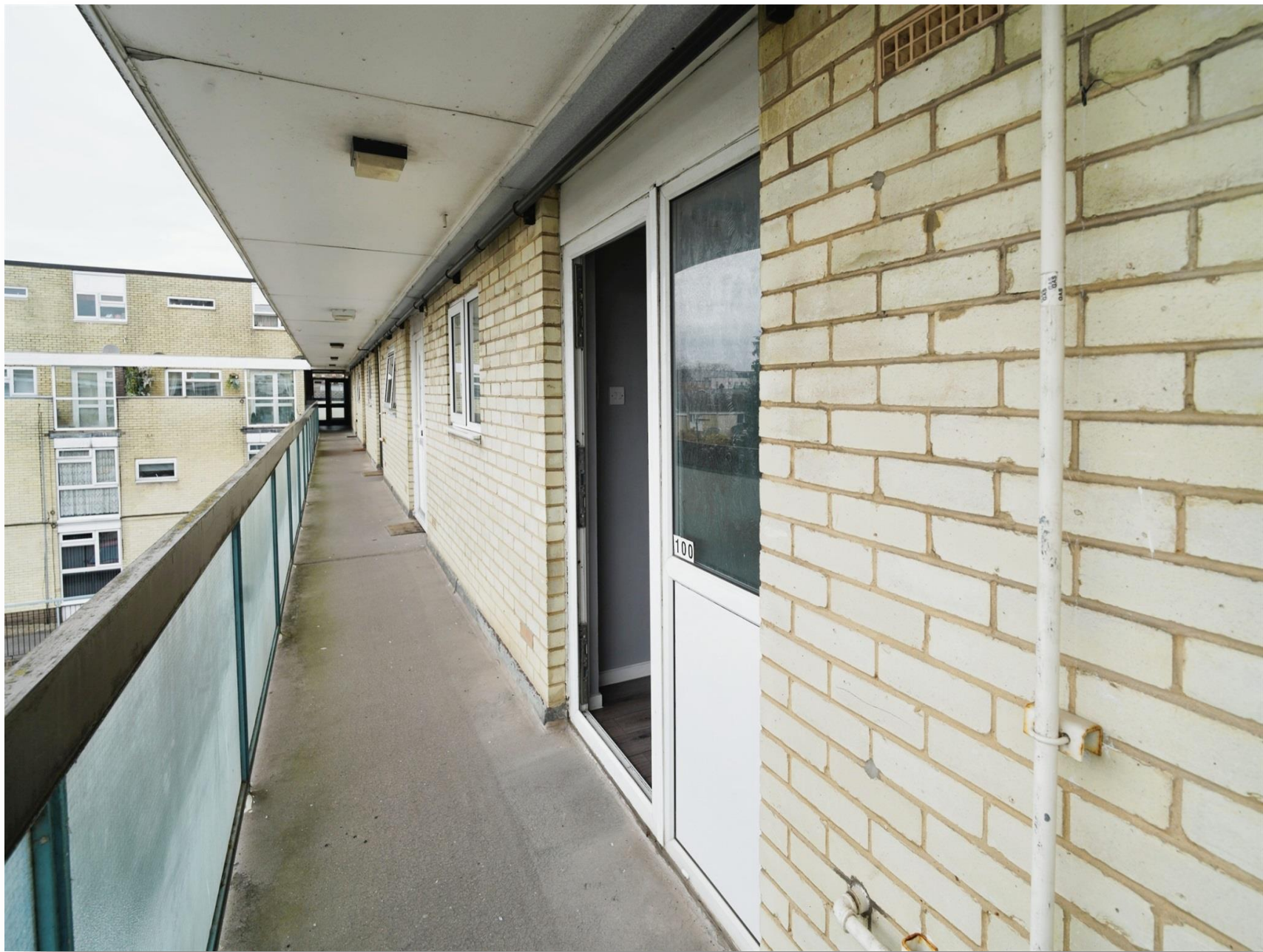
Ridding Close, Southampton SO15 5PP