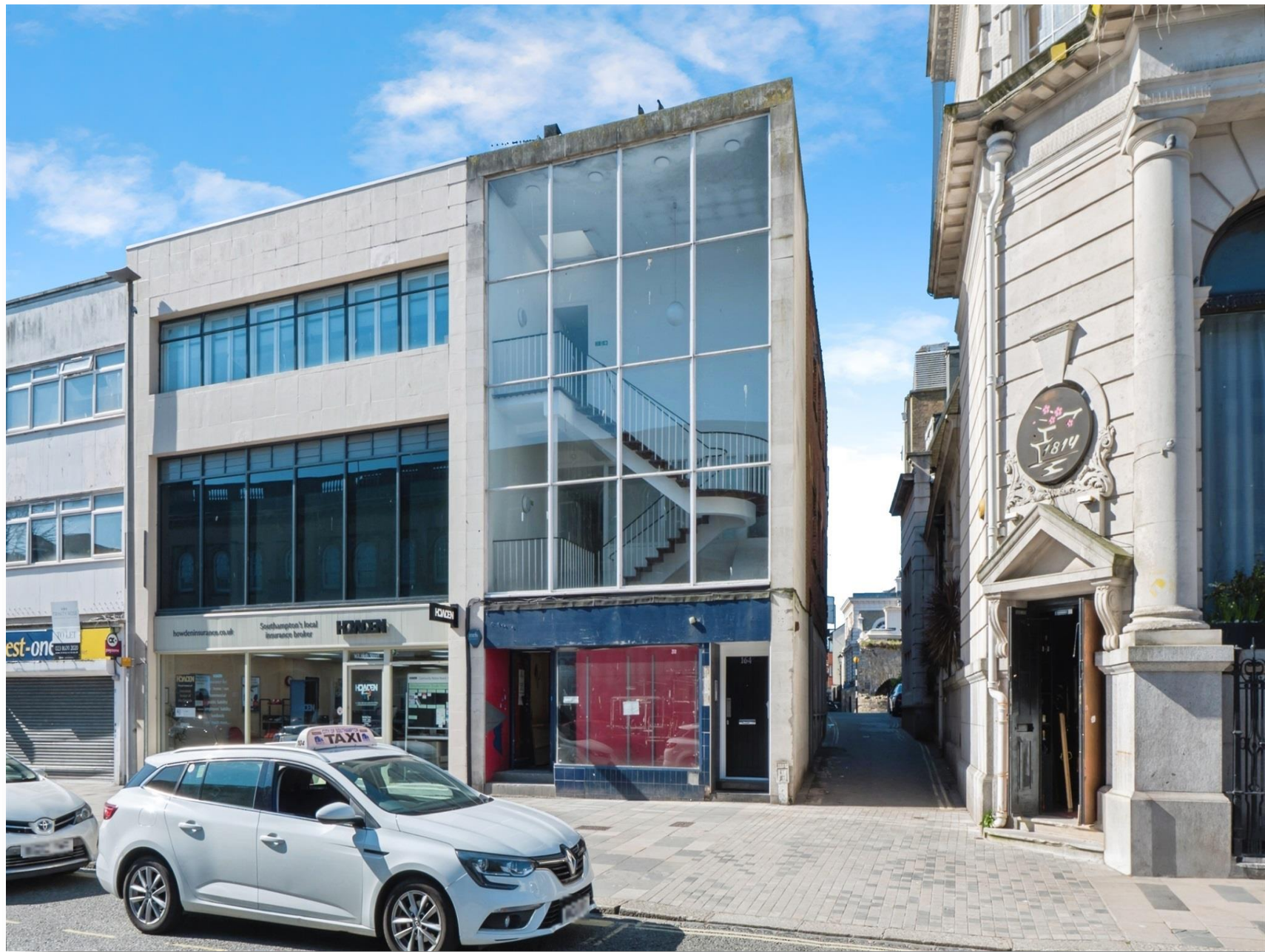
High Street, Southampton SO14 2BT