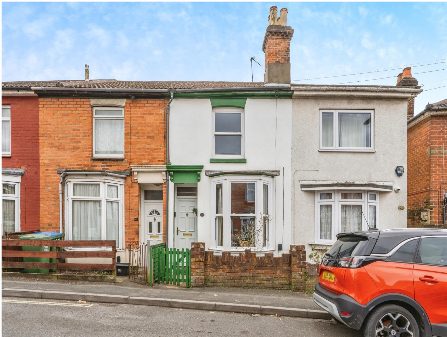
Foundry Lane, Southampton SO15 3FX