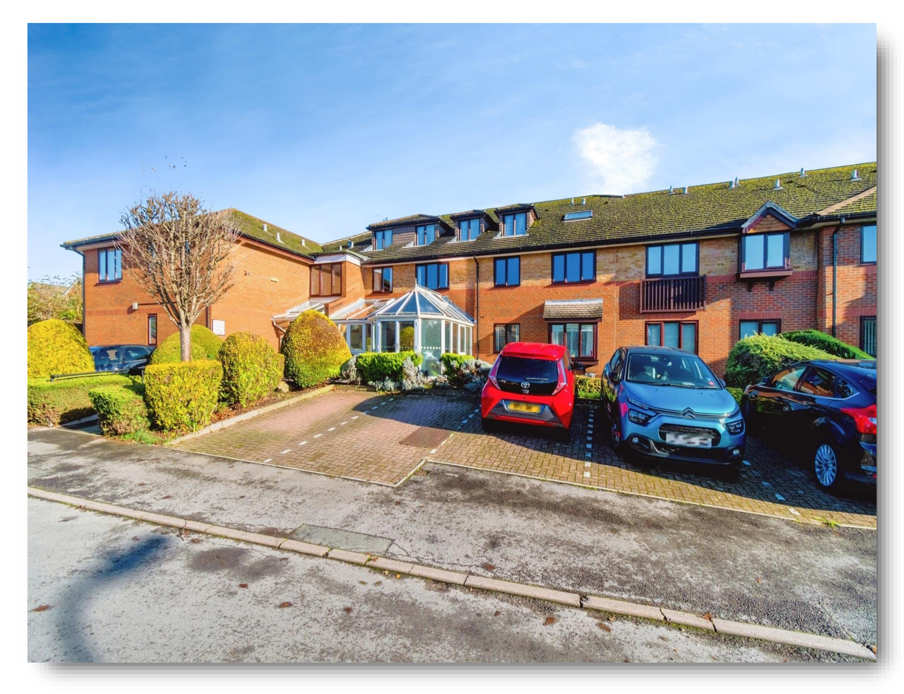
Chestnut Lodge Sherwood Close, Southampton SO16 7NT