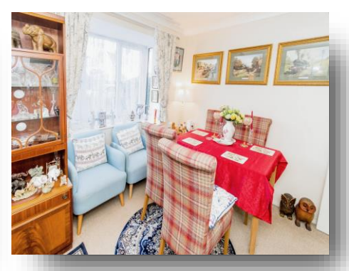
Burgess Rd