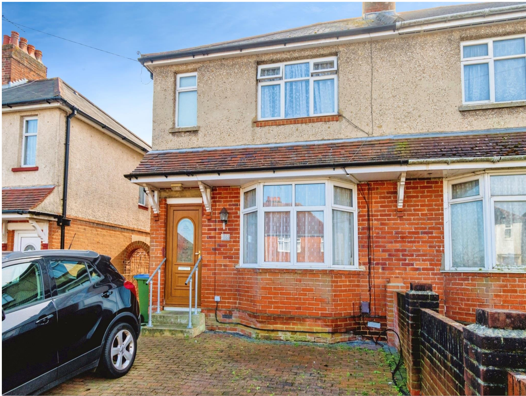
Honeysuckle Road, Southampton SO16 3BP