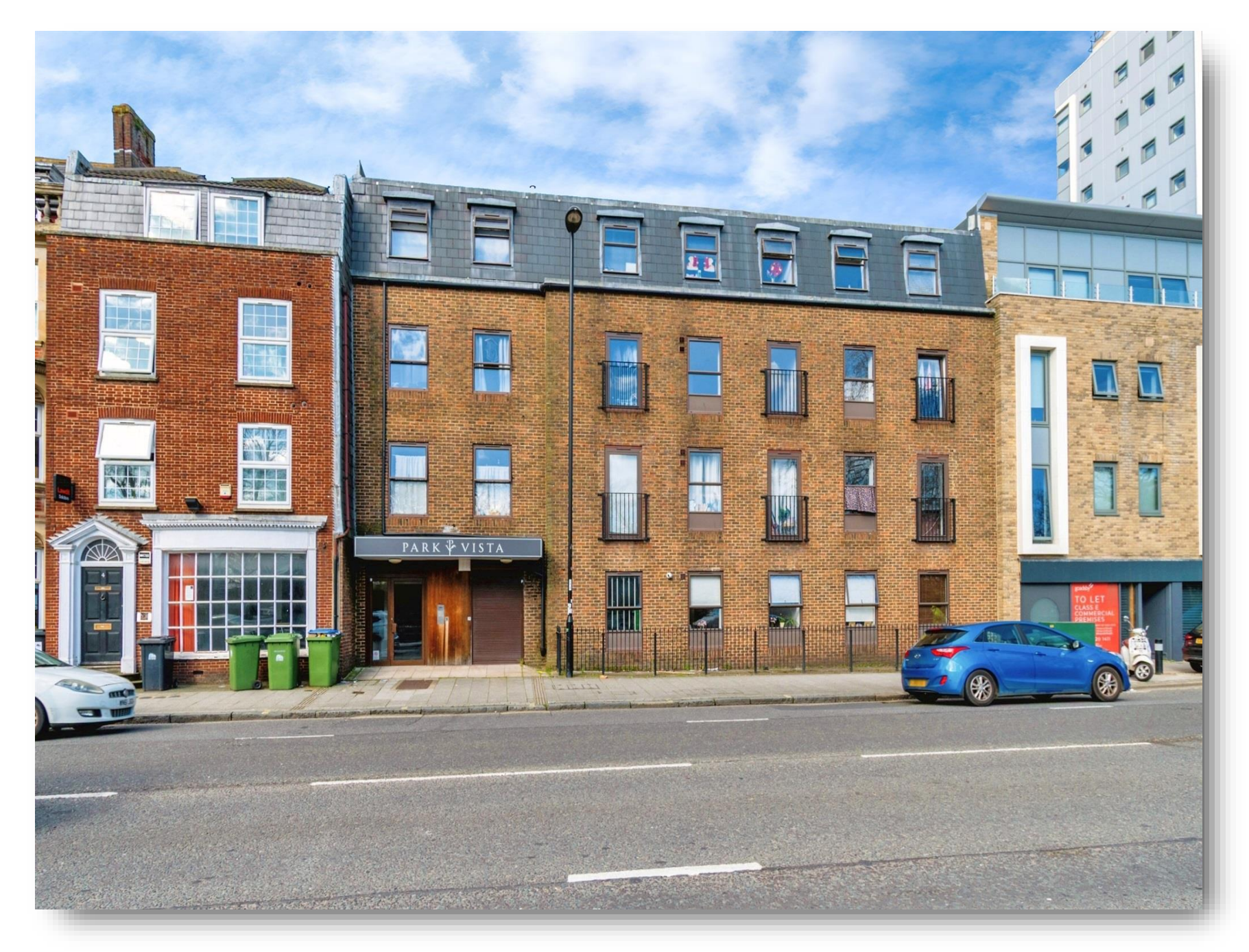
Park Vista Brunswick Place, Southampton SO15 2AN