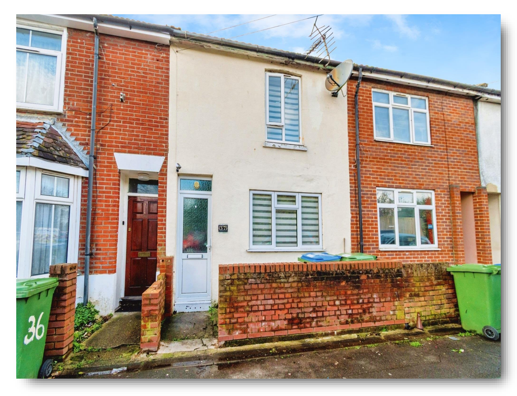
Hartington Road, Southampton SO14 0EW