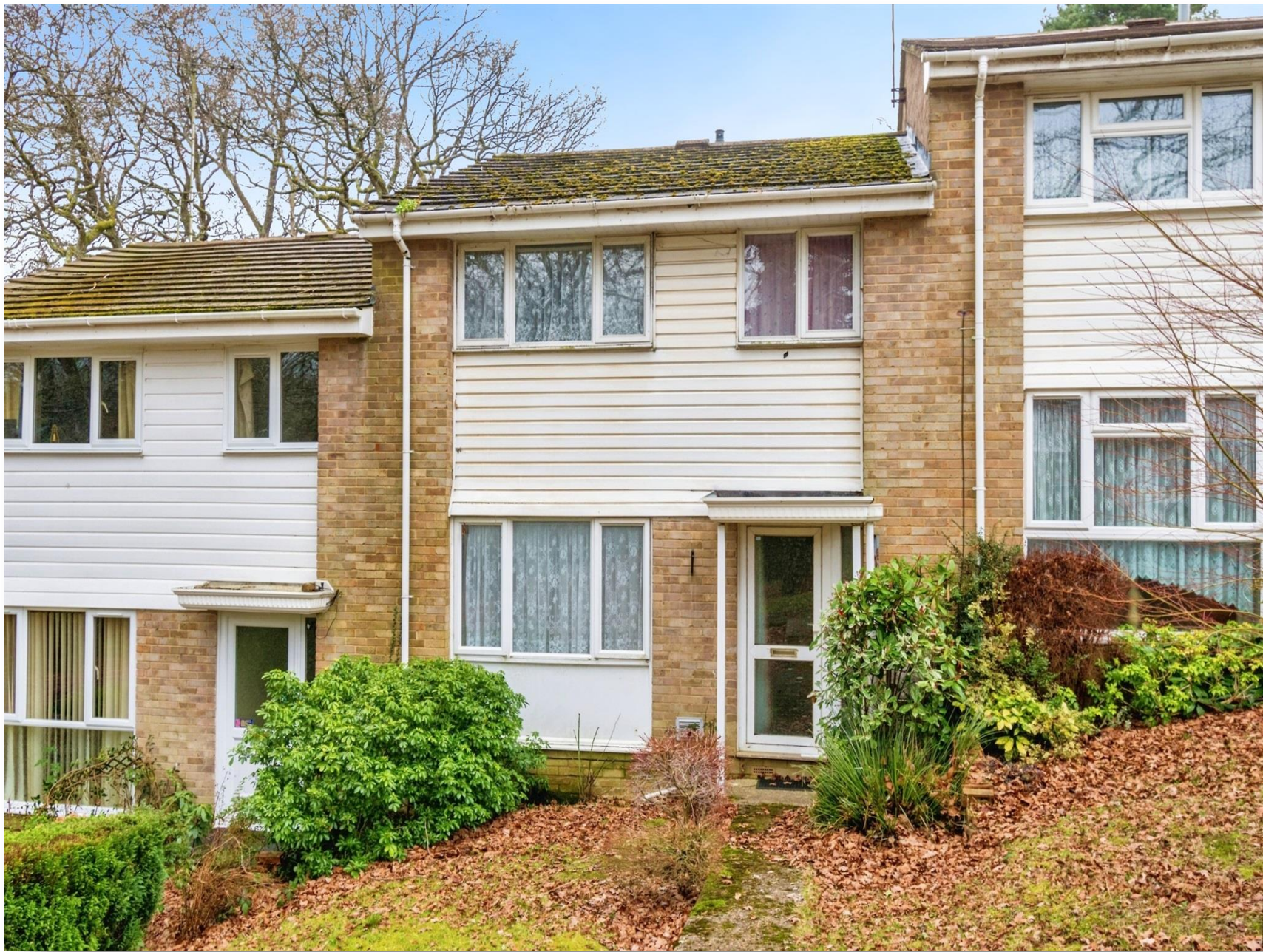
Dunster Close, Southampton SO16 8DF