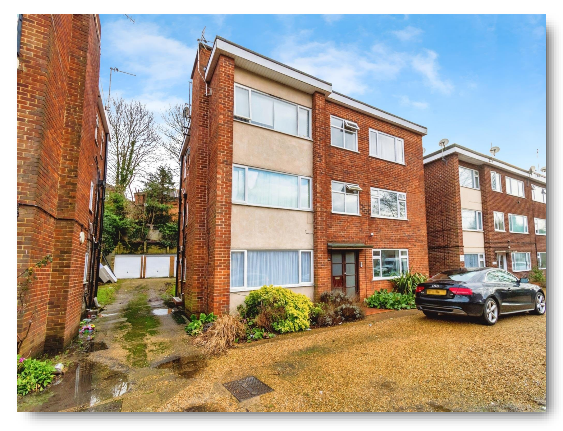
Woodside Court Woodside Road, Southampton SO17 2GR