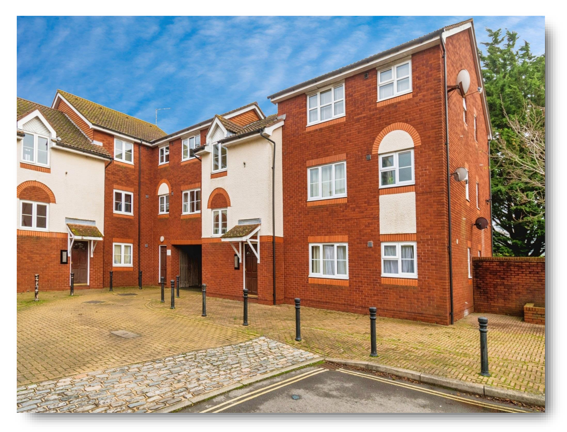
Captains Place, Southampton SO14 3TE