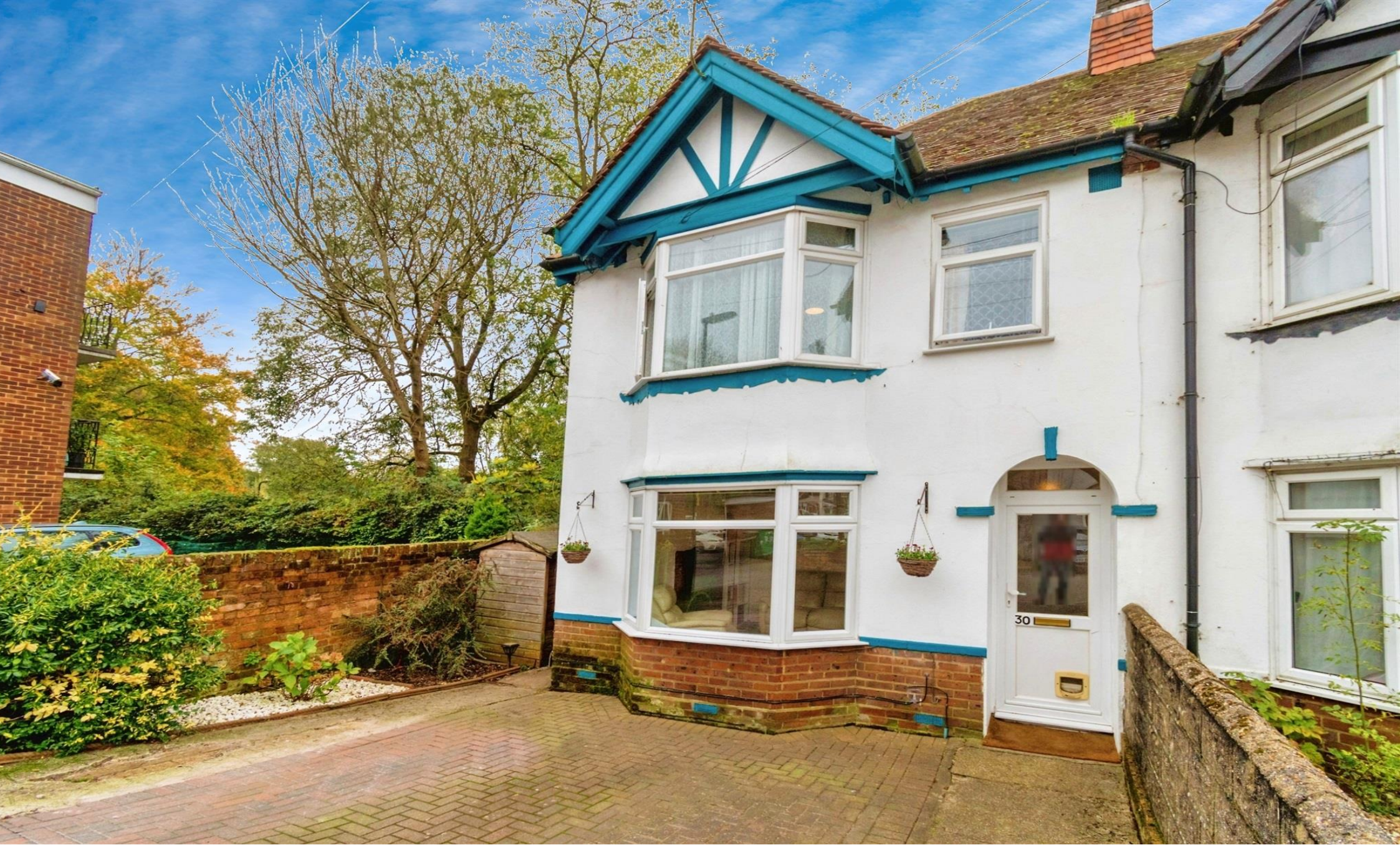
Somerset Terrace, Southampton SO15 3FW