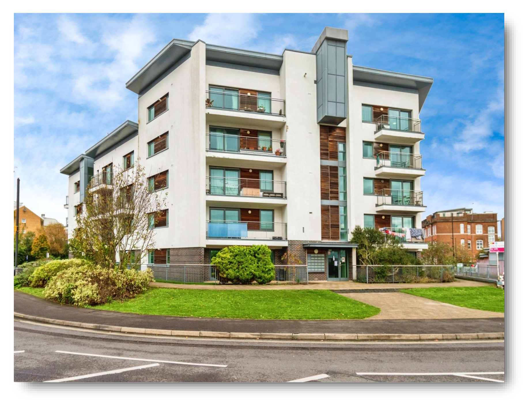
Andersons Road, Southampton SO14 5FD