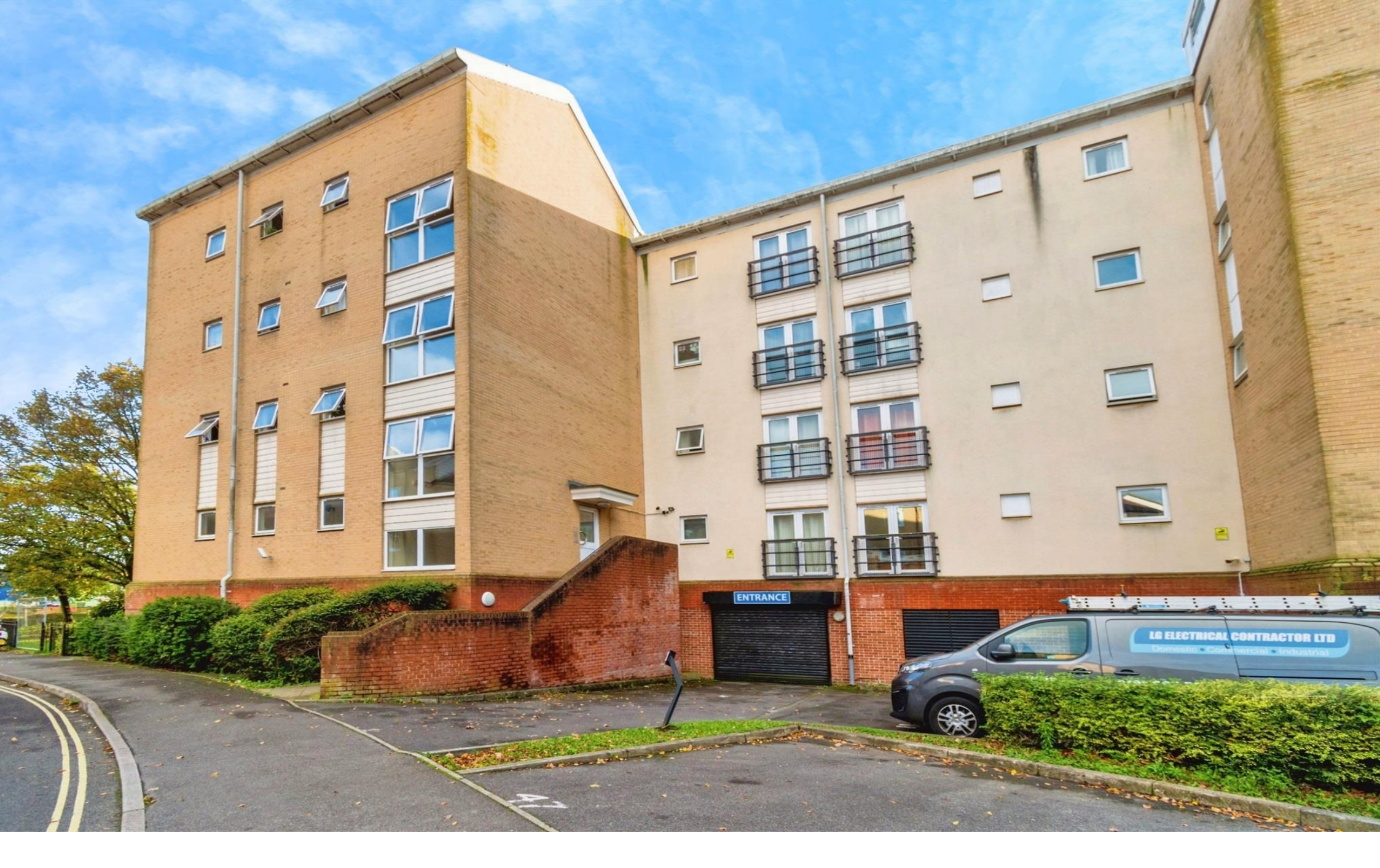
White Star Place, SOUTHAMPTON SO14 3GN