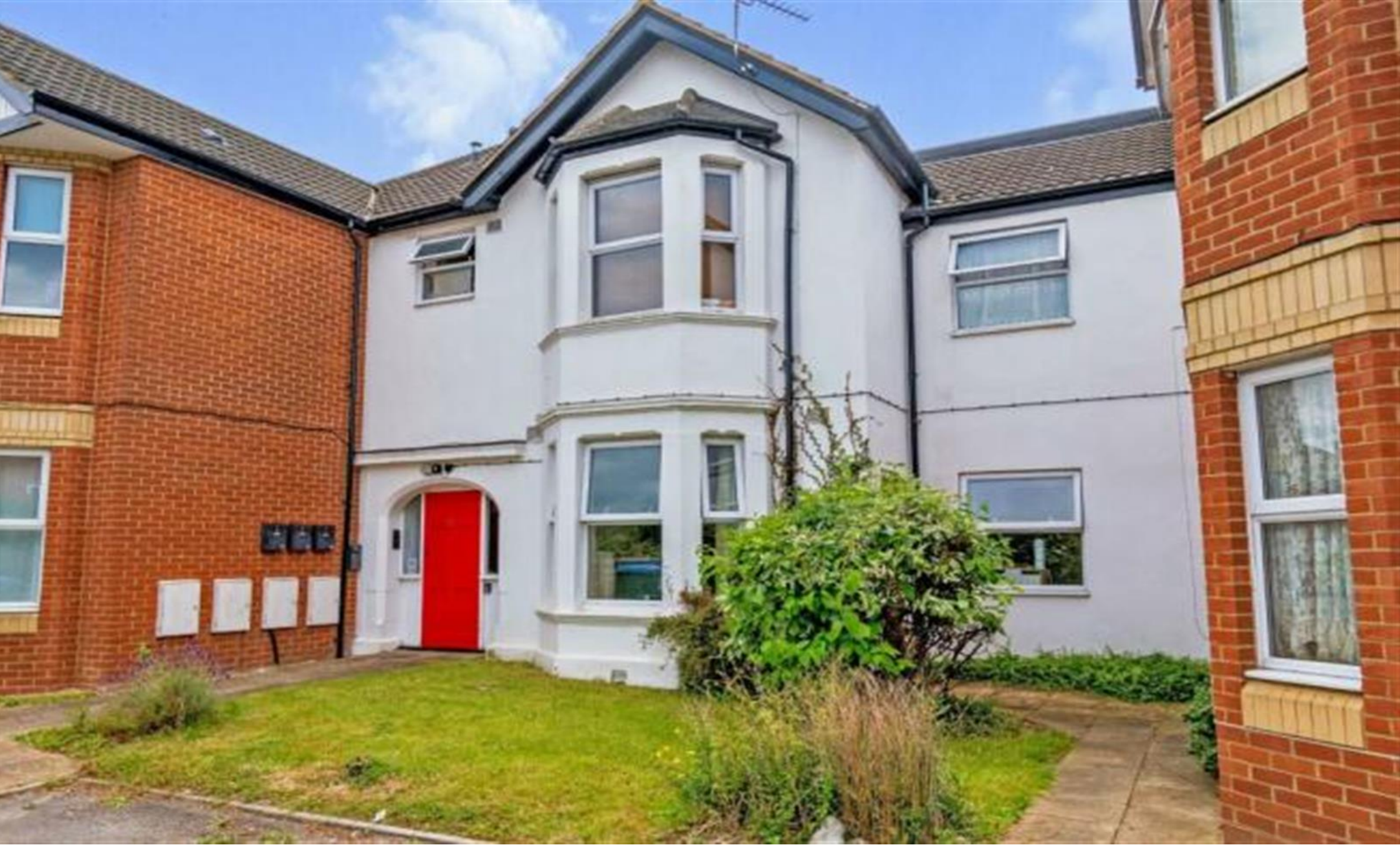
Clare Court Howard Road, Southampton SO15 5BG