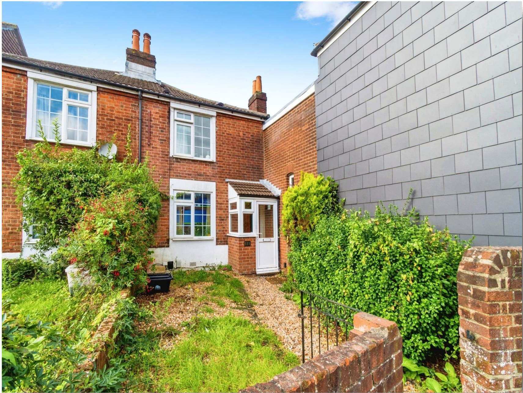
Portswood Road, Southampton SO17 2FU