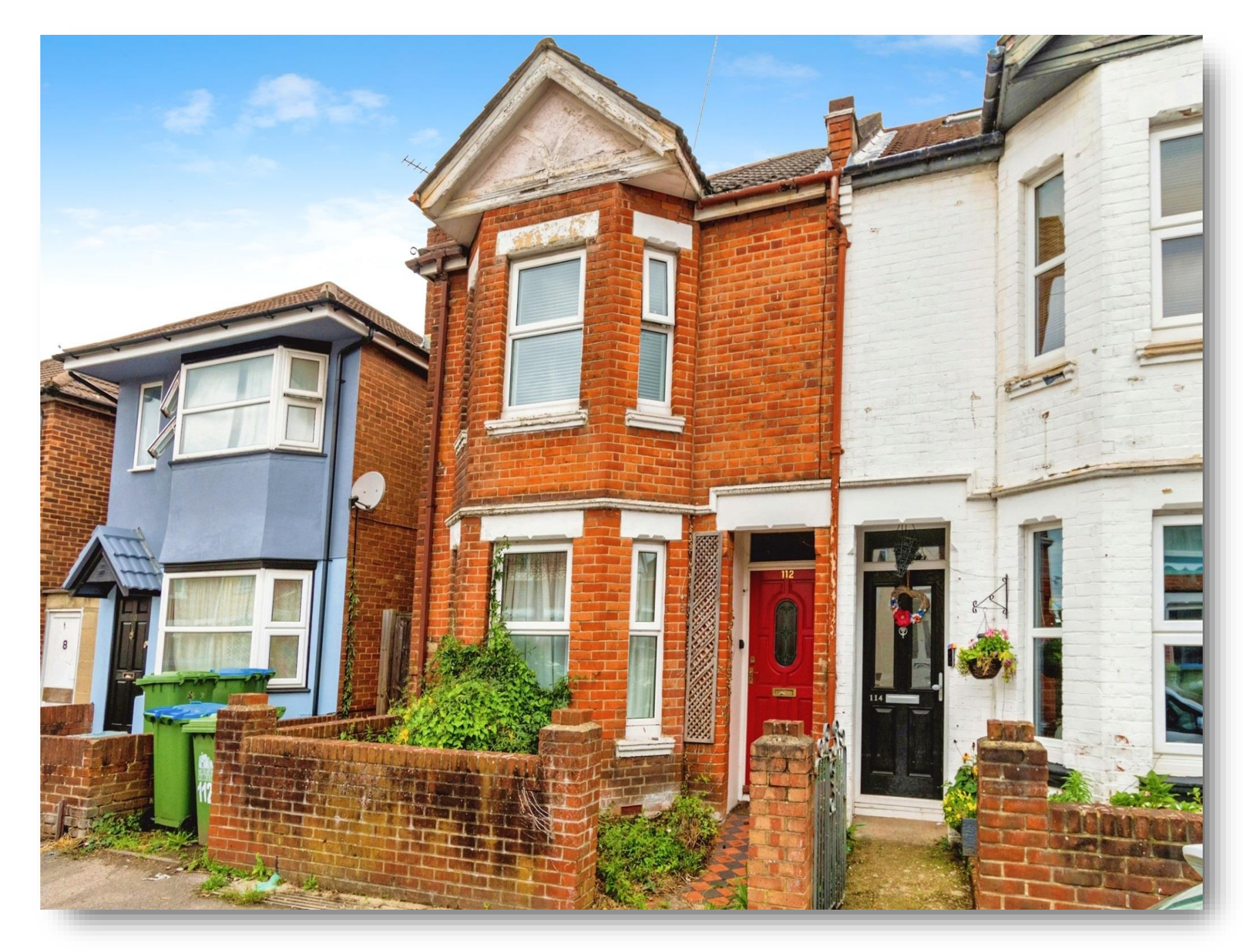
Malmesbury Road, Southampton SO15 5FQ