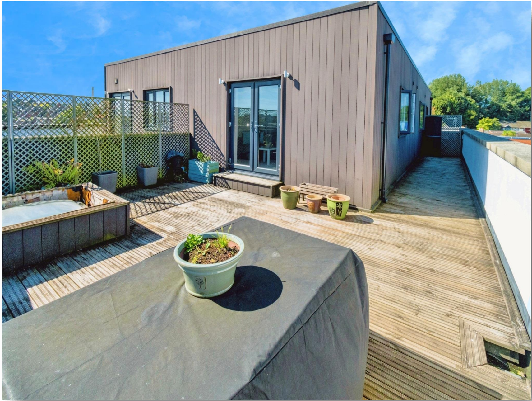
Kingsbury House, Kingsbury Road, Southampton SO14 0JT