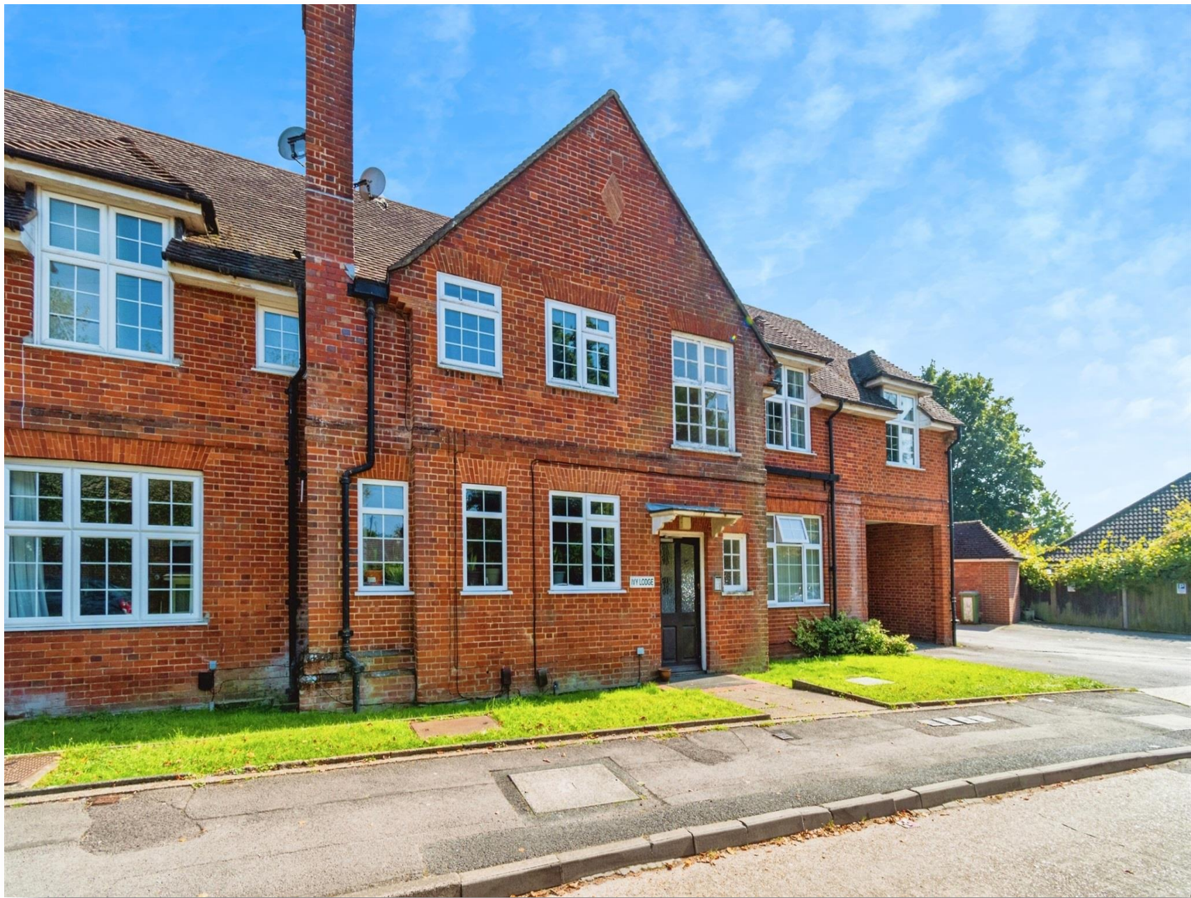
Ivy Lodge Seagarth Lane, Southampton SO16 6SX