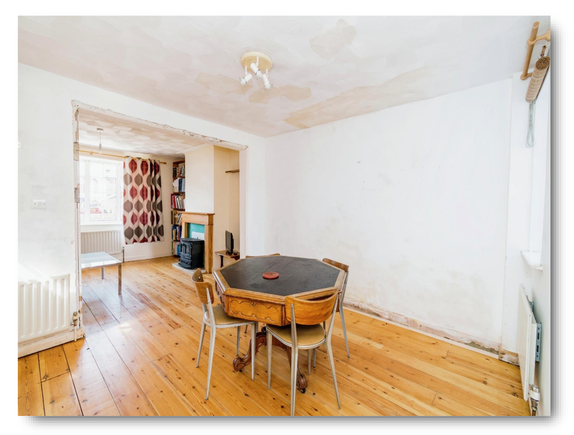
Priory Road, Southampton SO17 2HS