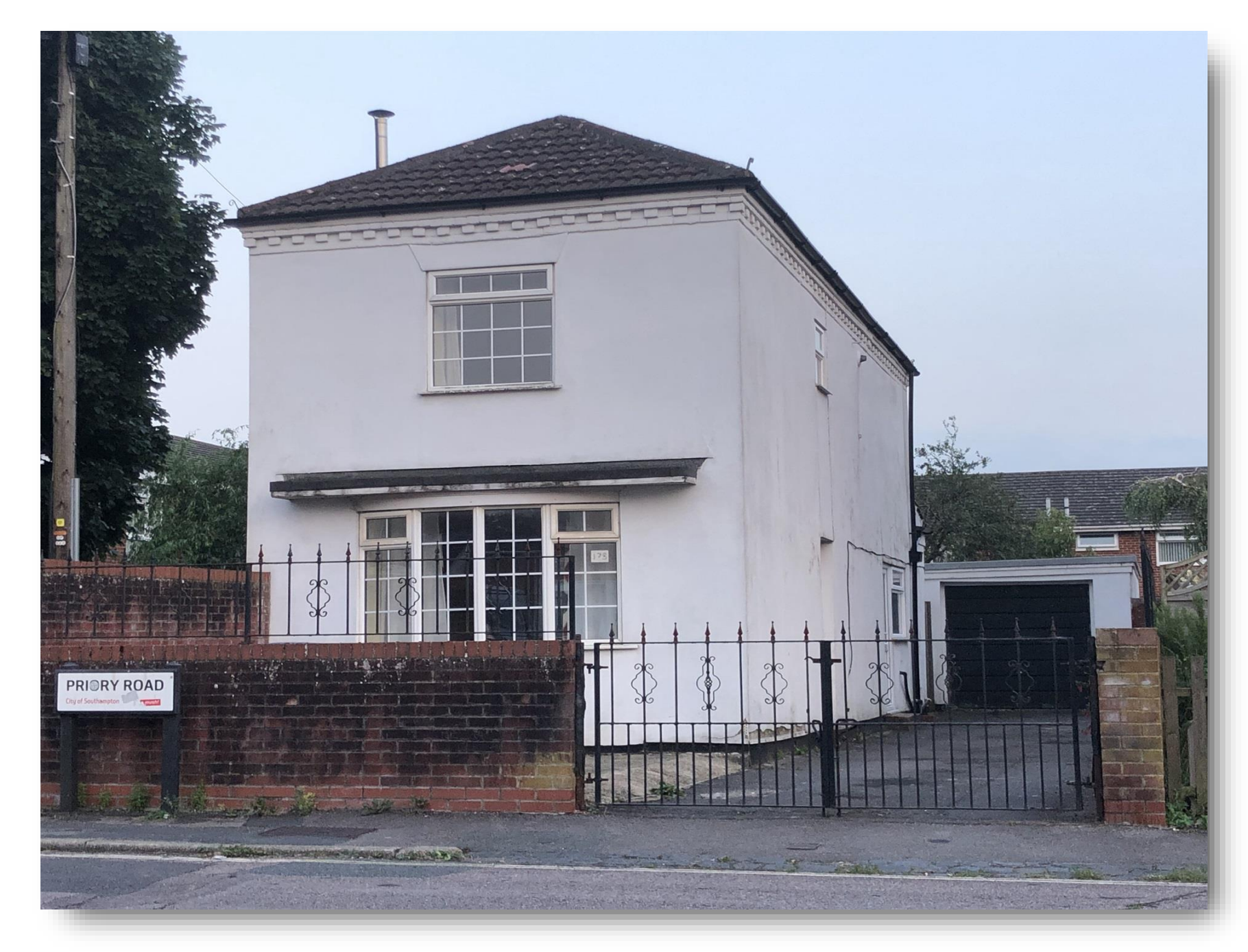
Priory Road, Southampton SO17 2HS