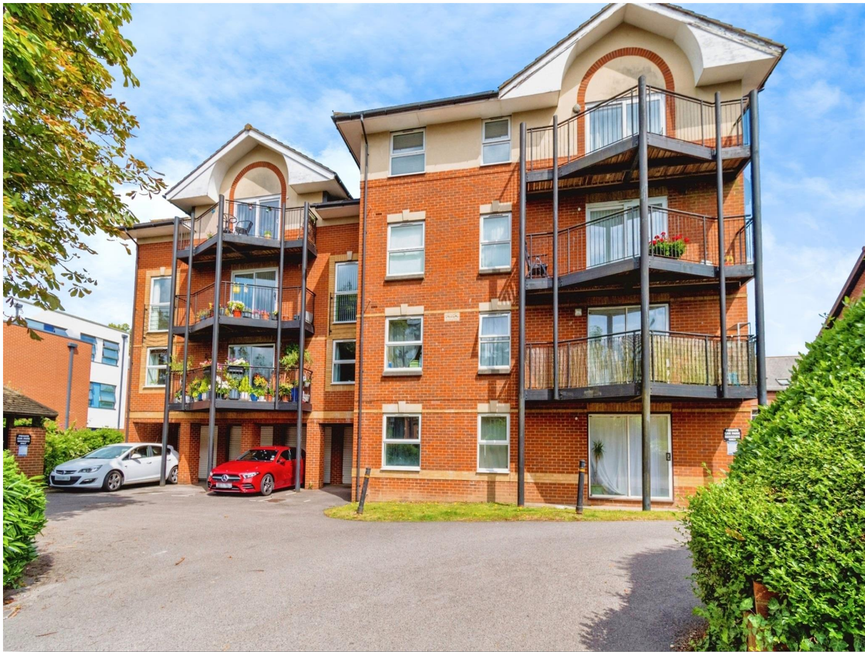
Banister Gate Archers Road, Southampton SO15 2NR