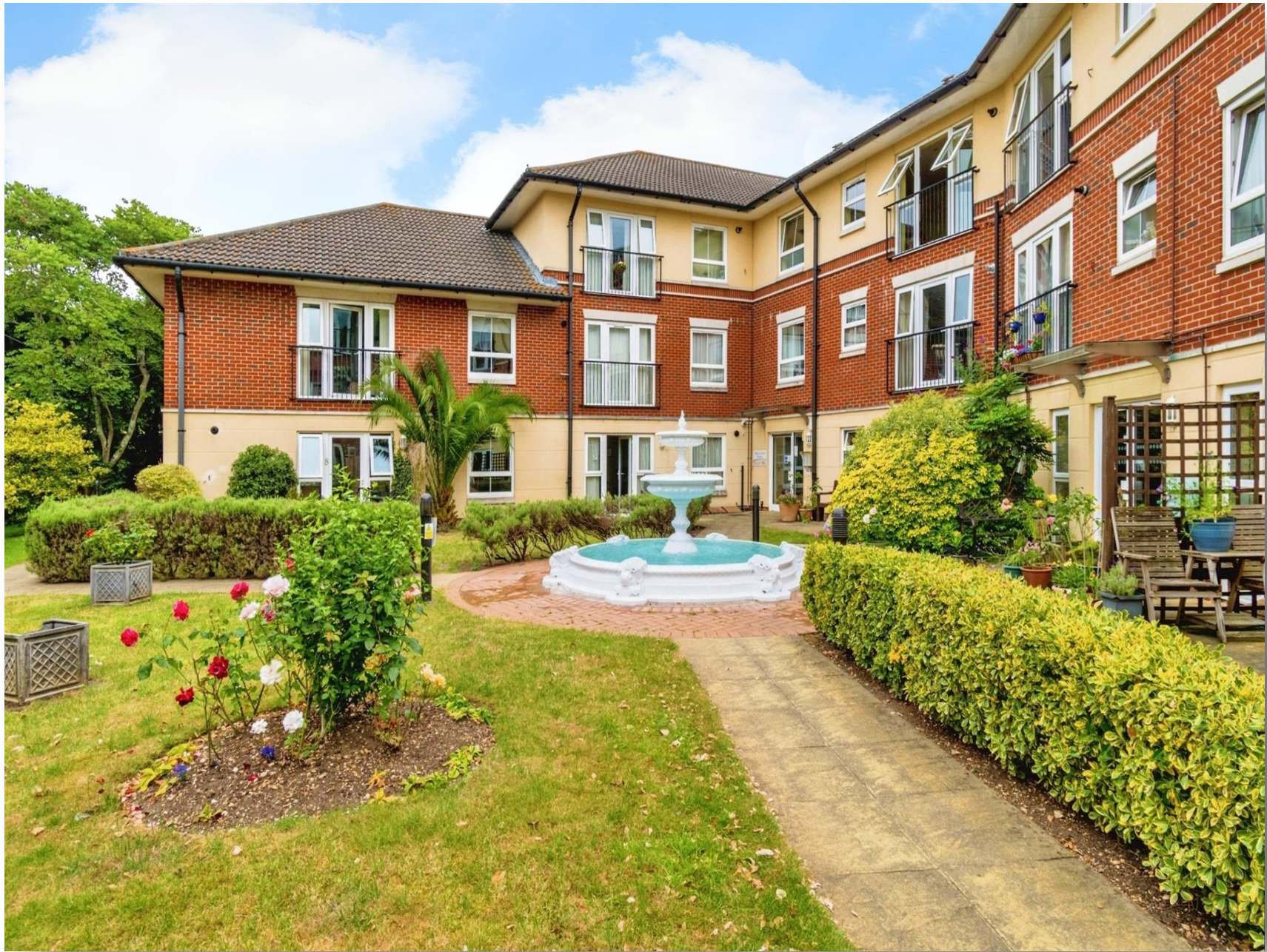
Hebron Court, Rollesbrook Gardens, Southampton SO15 5WB