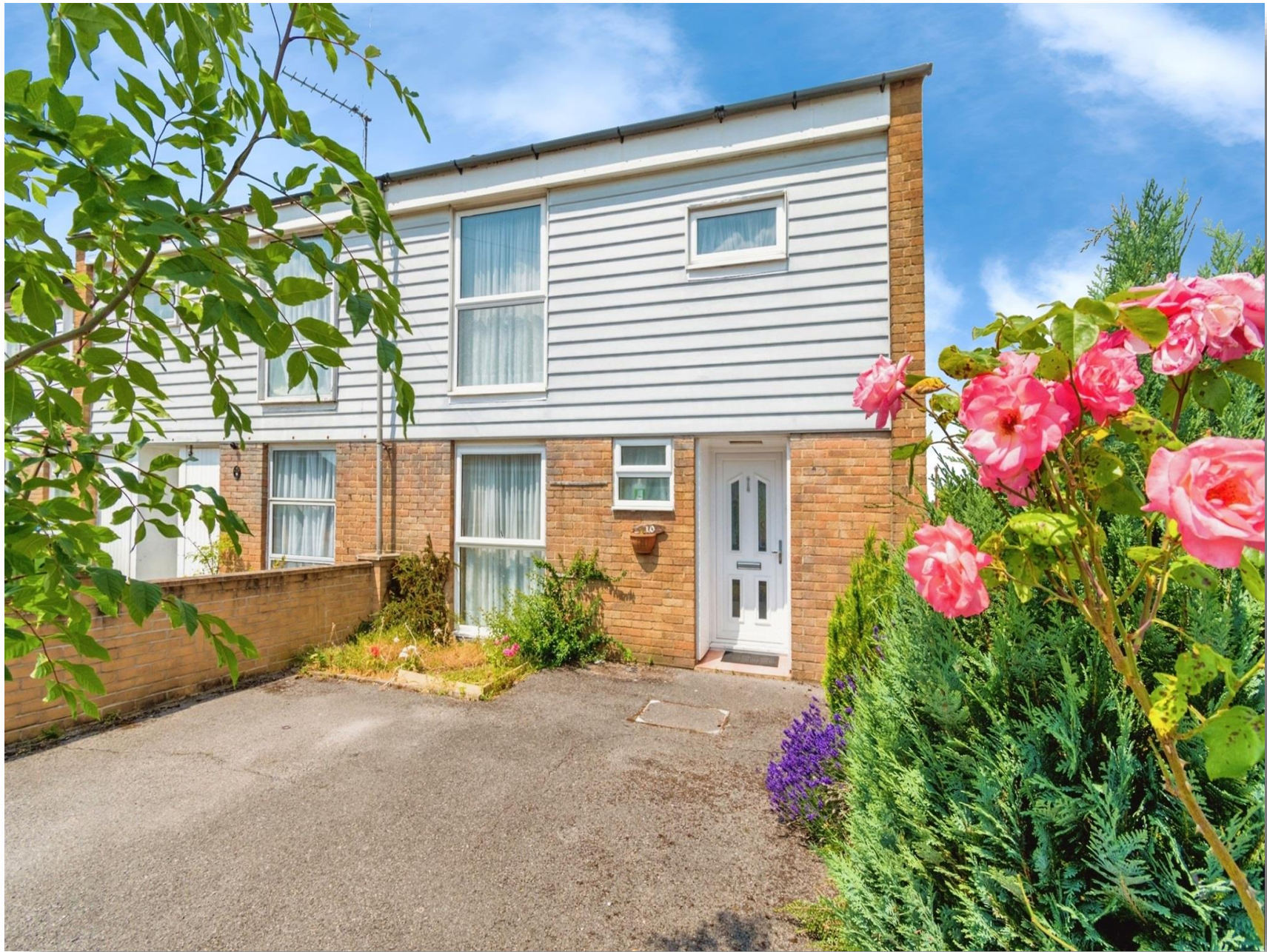
Mercury Close, Southampton SO16 8BH