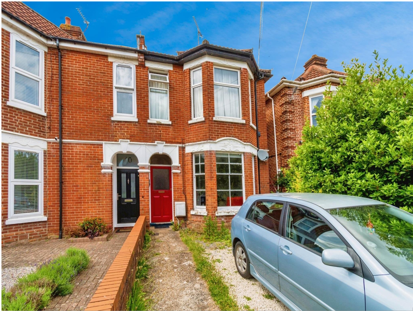
Belle Moor Road, Southampton SO15 5JW