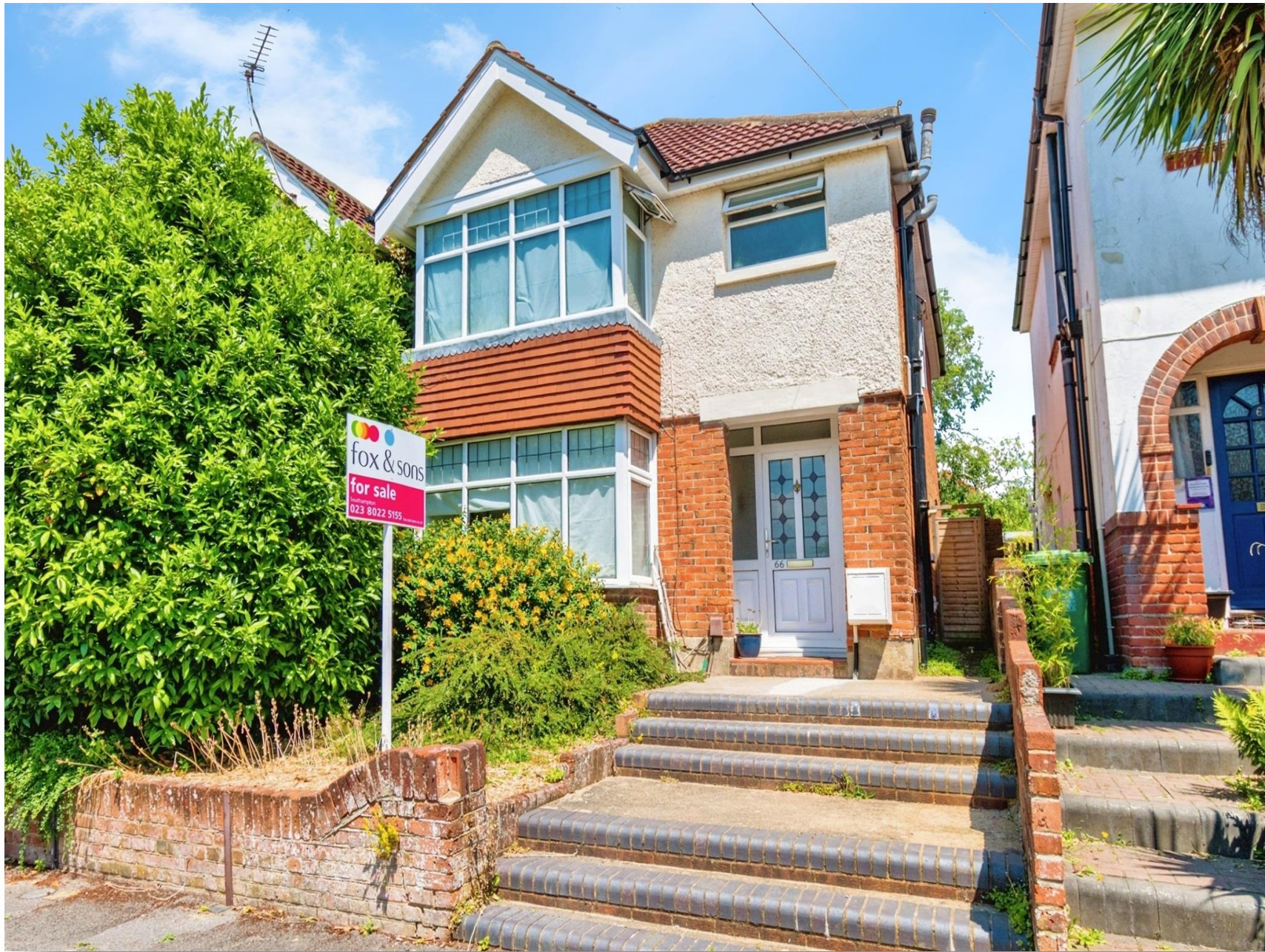
Norfolk Road, Southampton SO15 5AQ