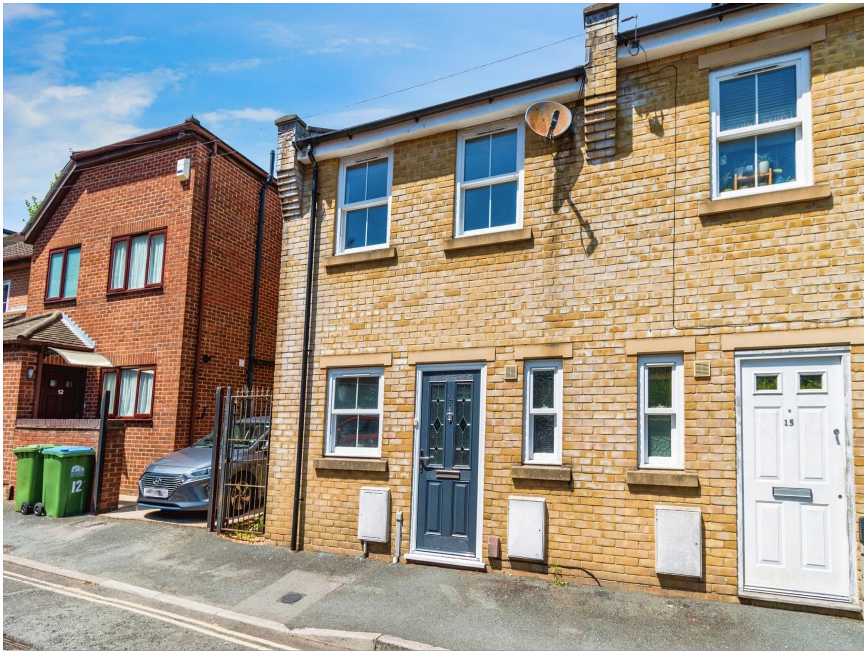
Mordaunt Road, Southampton SO14 6GP