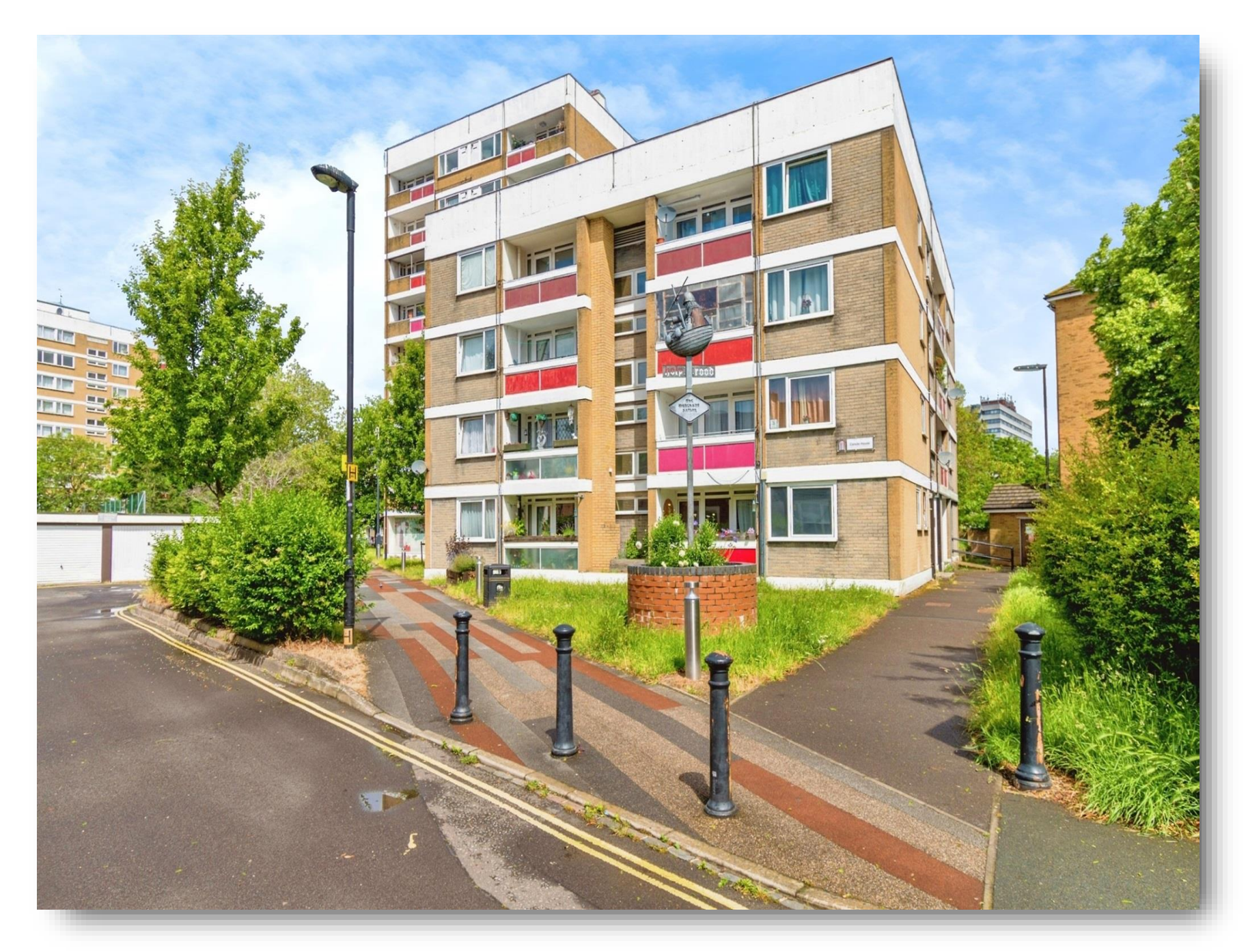
Canute House King Street, Southampton SO14 3DG