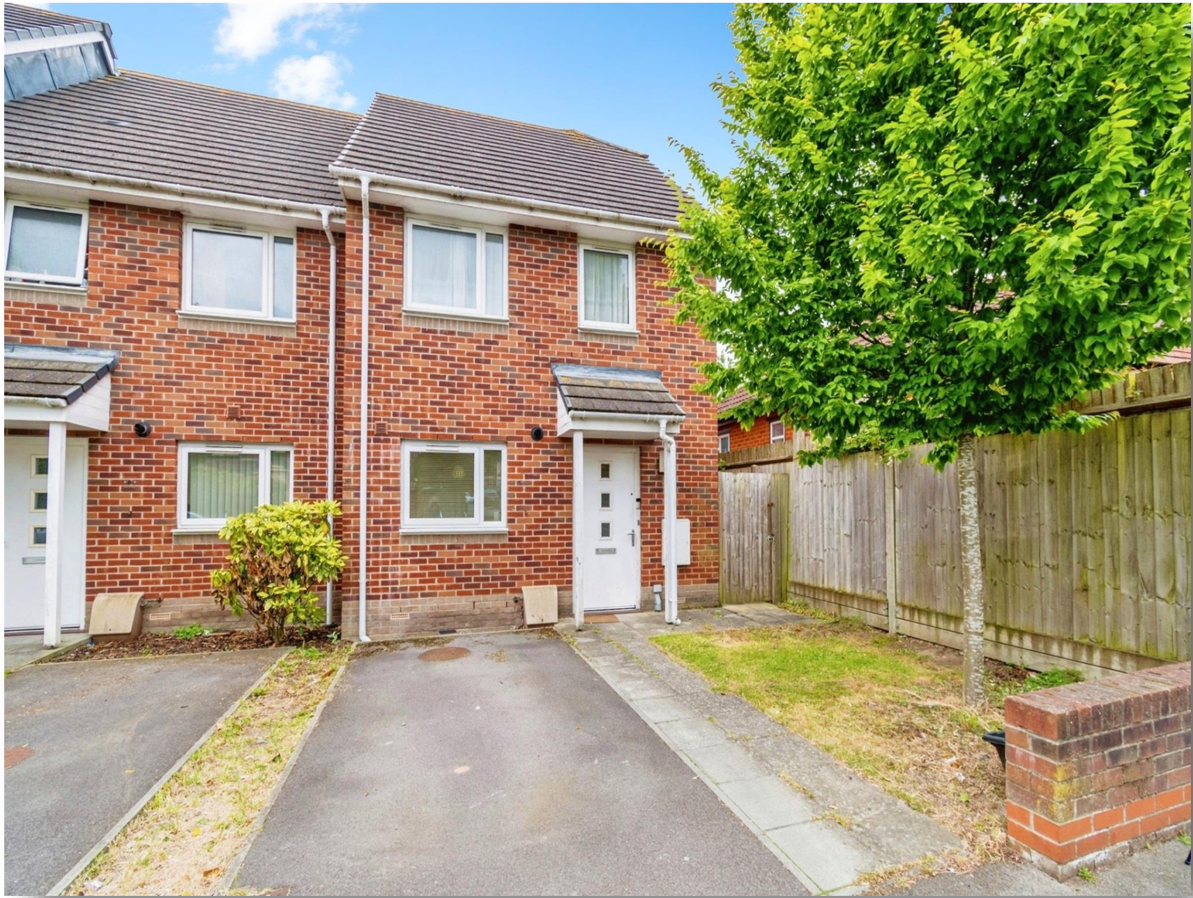
Oakley Road, Southampton SO16 4LG