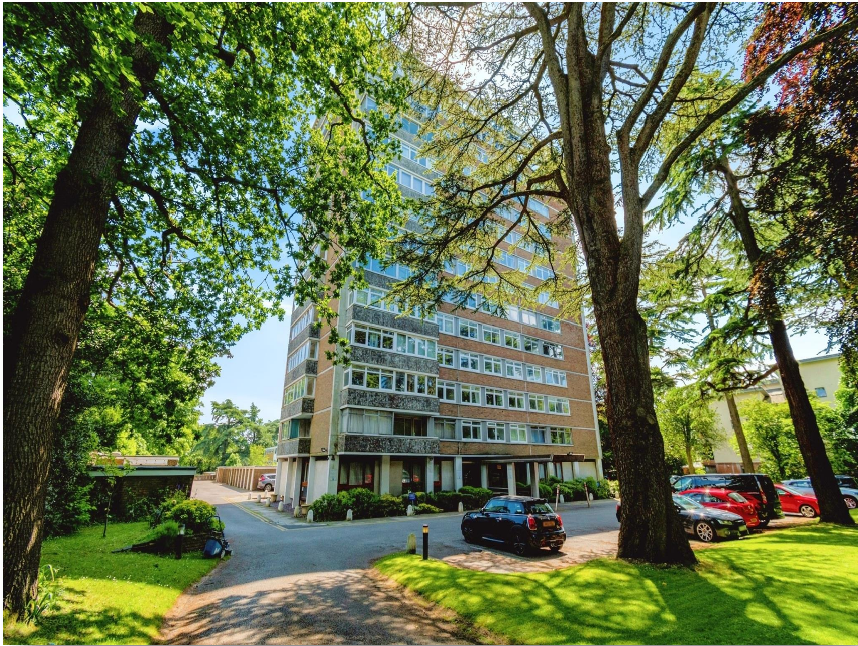
Brampton Tower Bassett Avenue, Southampton SO16 7FB