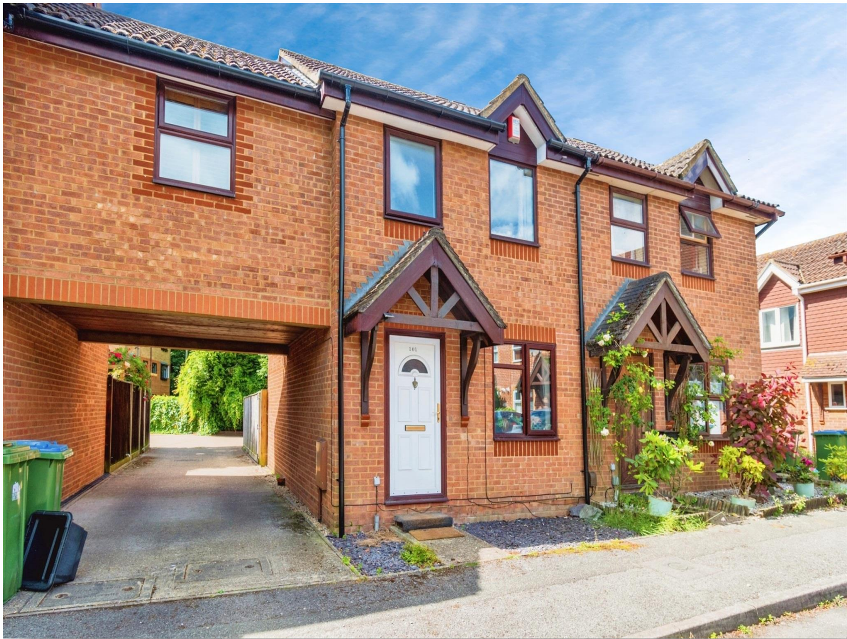
Brunel Road, Southampton SO15 0LR