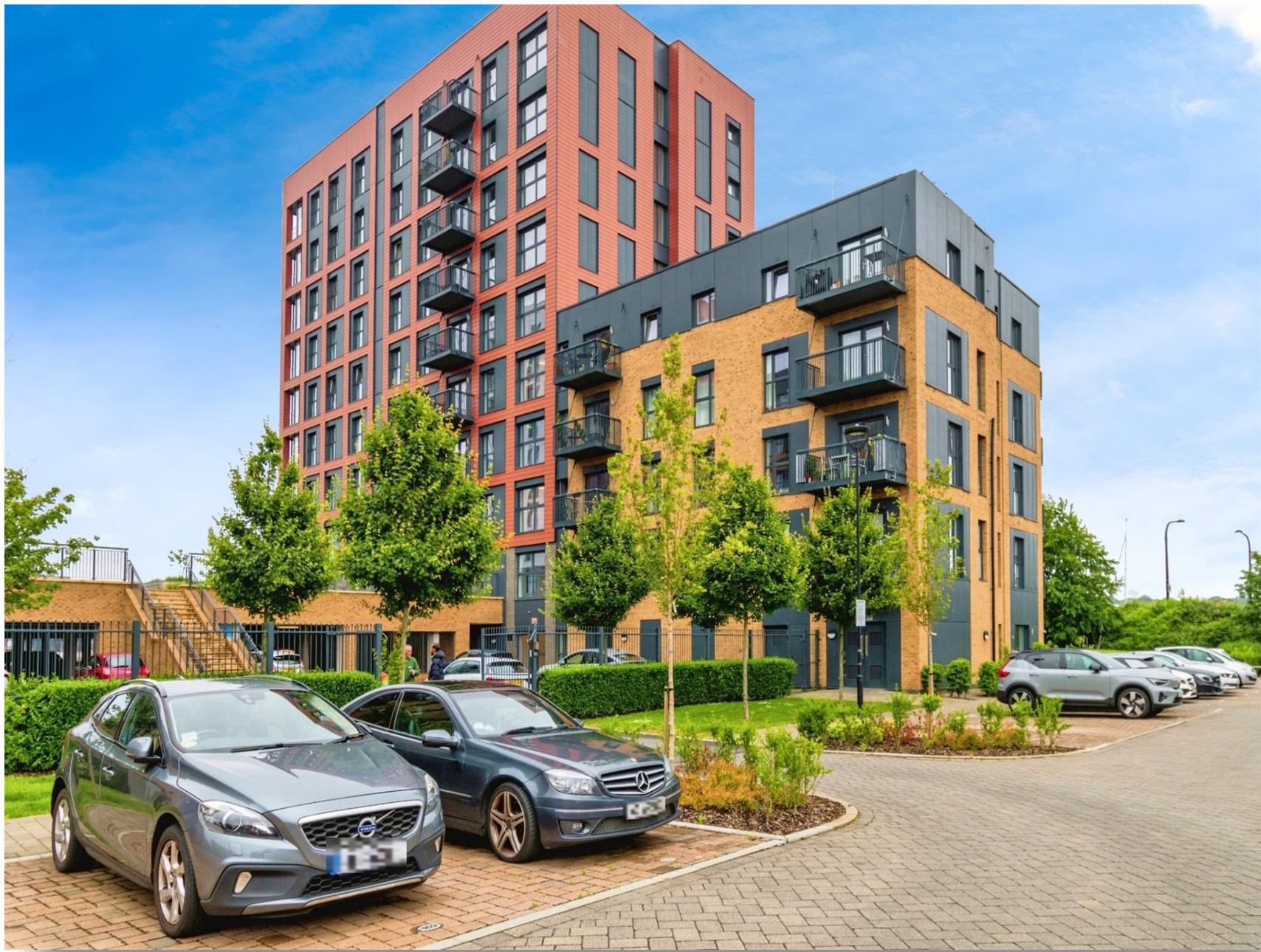
Television House Meridian Way, Southampton SO14 0FS