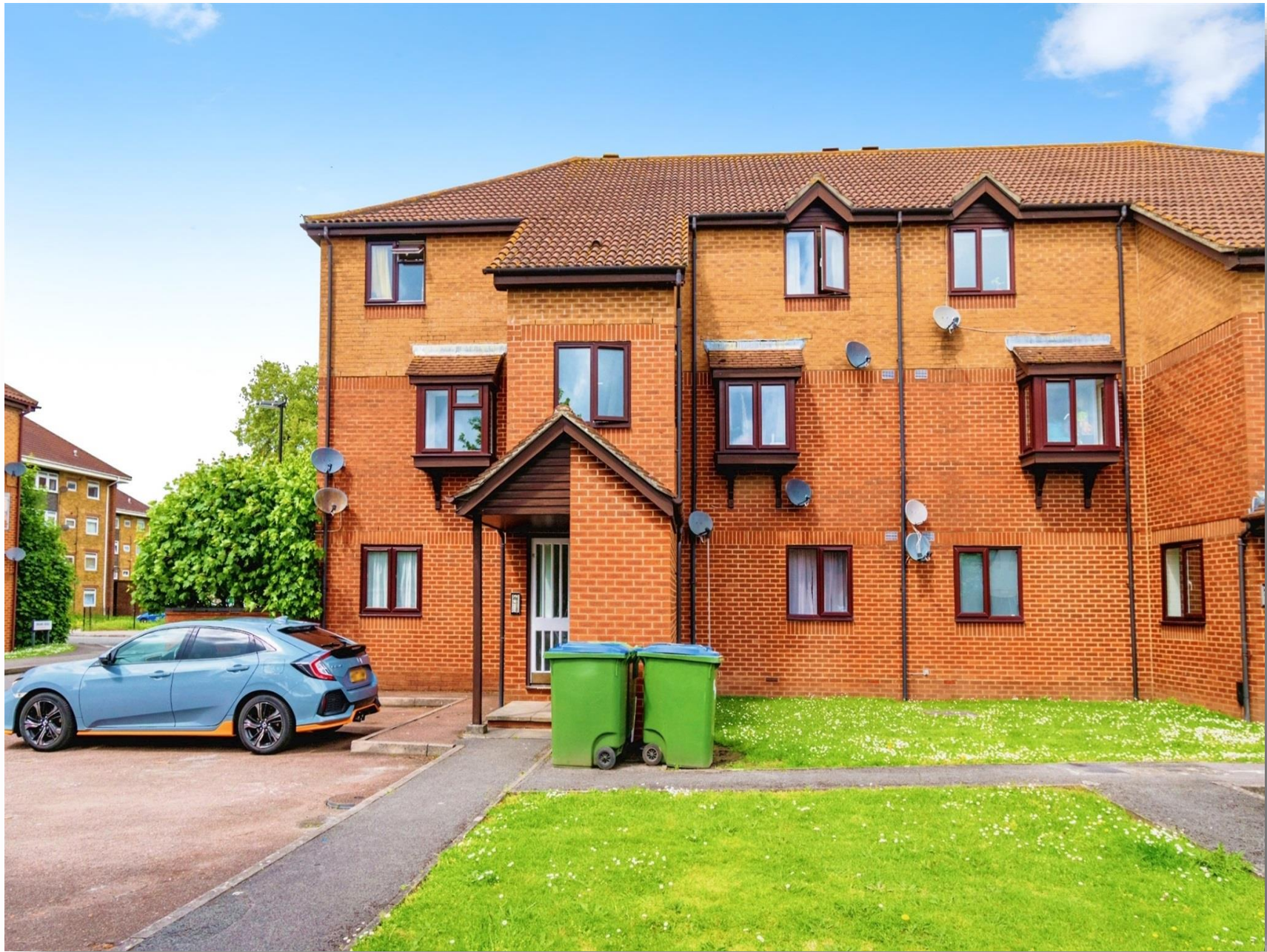
Brunel Road, Southampton SO15 0LQ