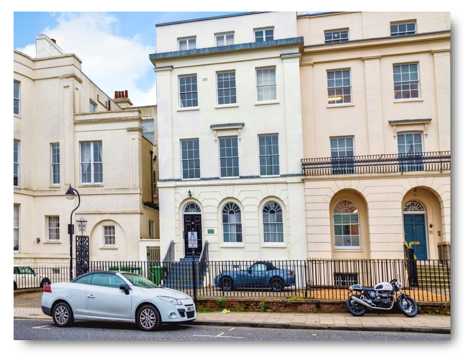
Adyar House Carlton Crescent, Southampton SO15 2EW