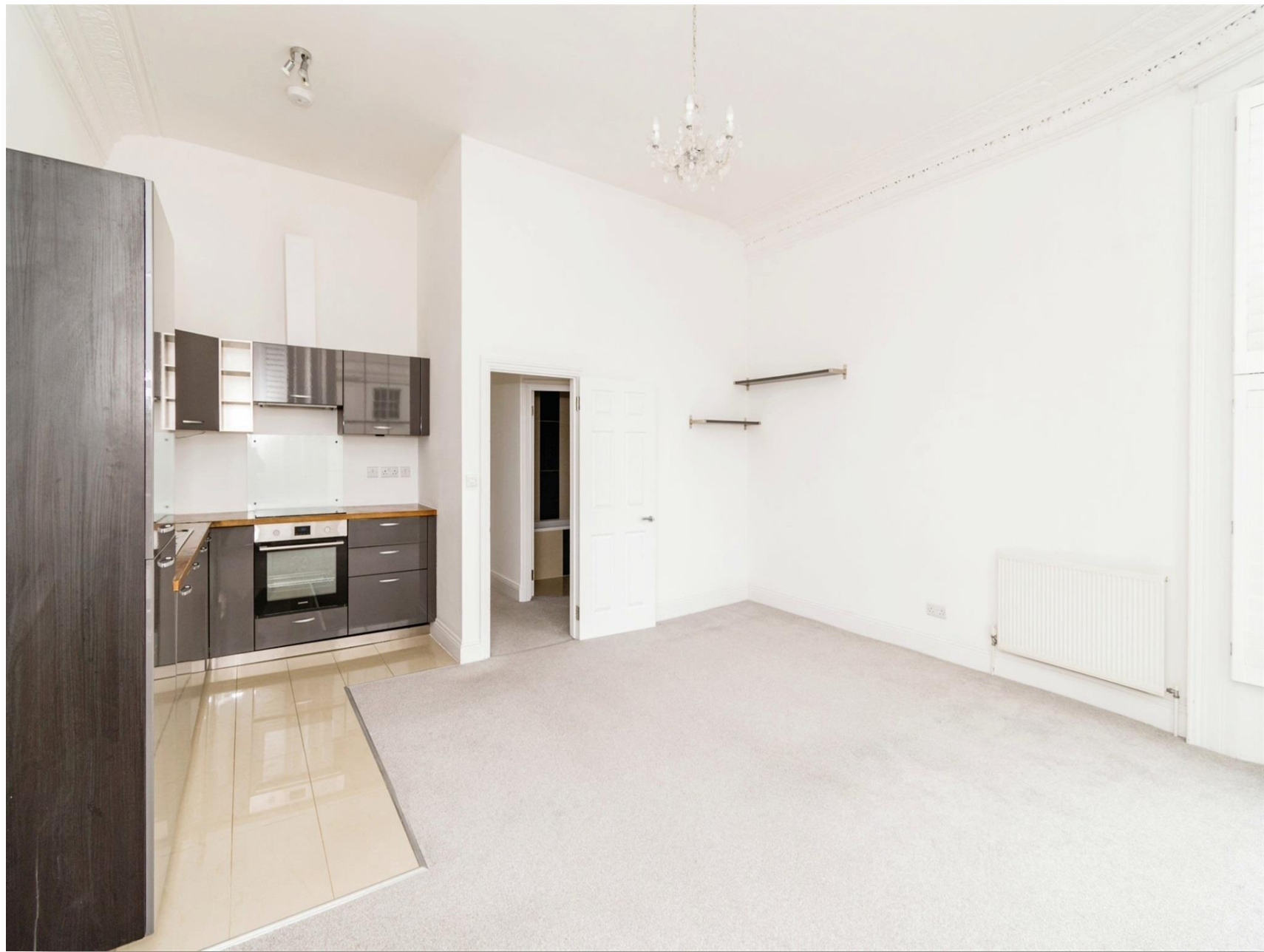
Avondale House Carlton Crescent, Southampton SO15 2EW