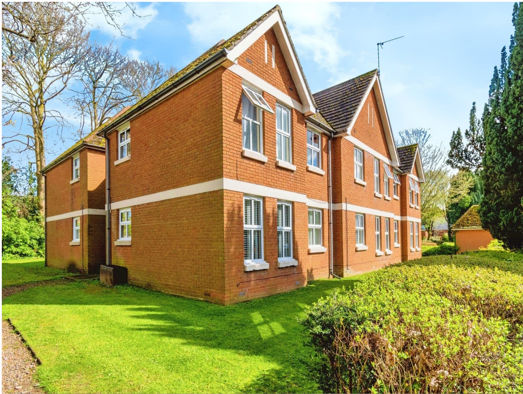
Edinburgh Court Regents Park Road, Southampton SO15 8PH