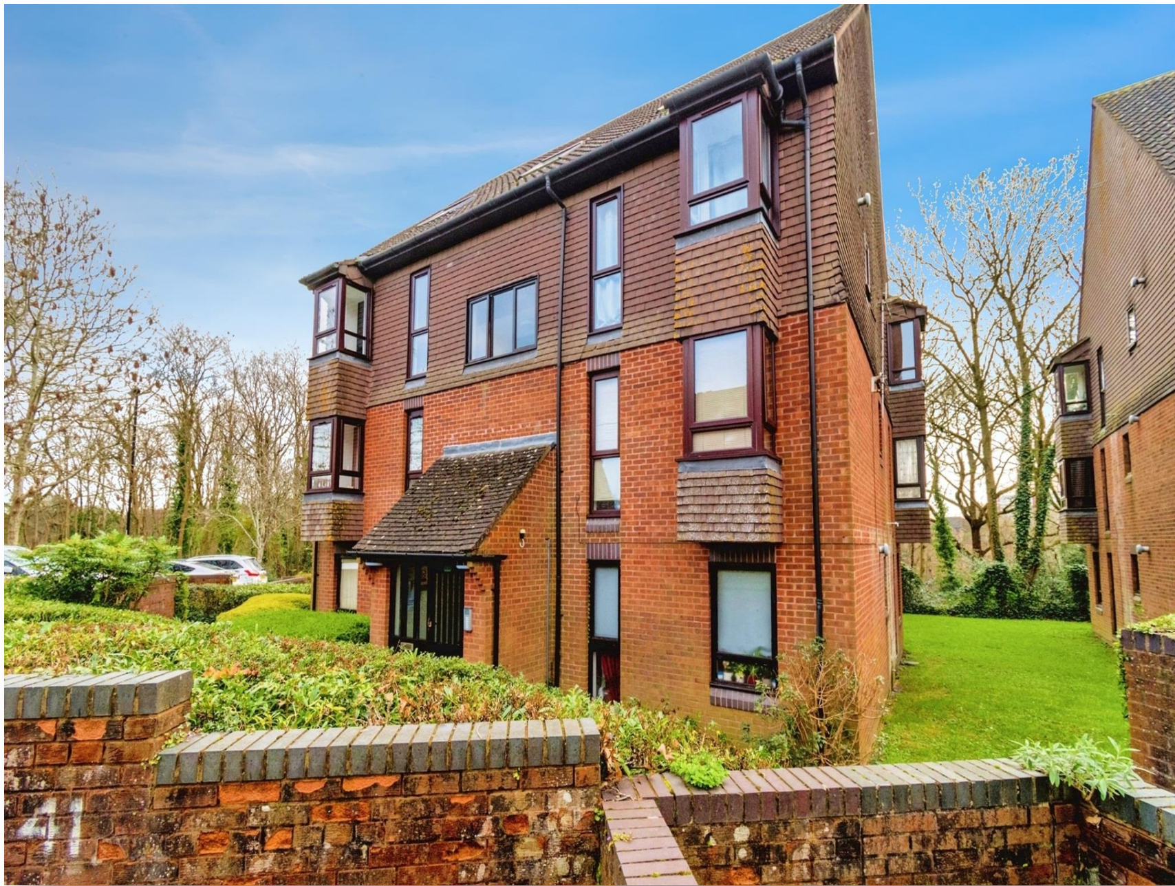
Tremona Court, Tremona Road, Southampton SO16 6TH