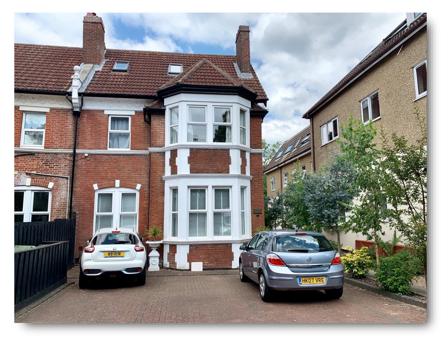
Firtree Lodge Court Road, Southampton SO15 2JR