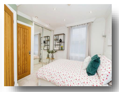
view this property online fox-and-sons.co.uk/Property/SOU116246