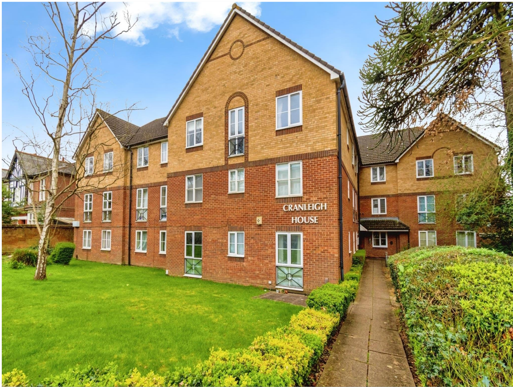
Cranleigh House Westwood Road, Southampton SO17 1DN