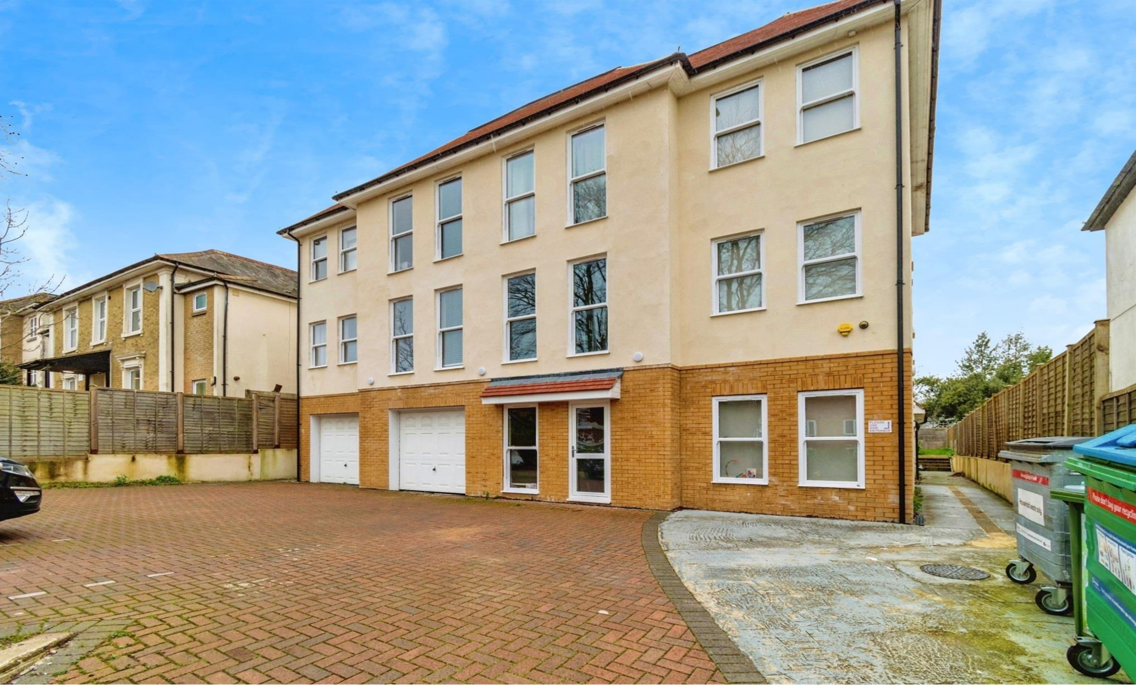
Beech Court, Lawn Road, Southampton SO17 2EX