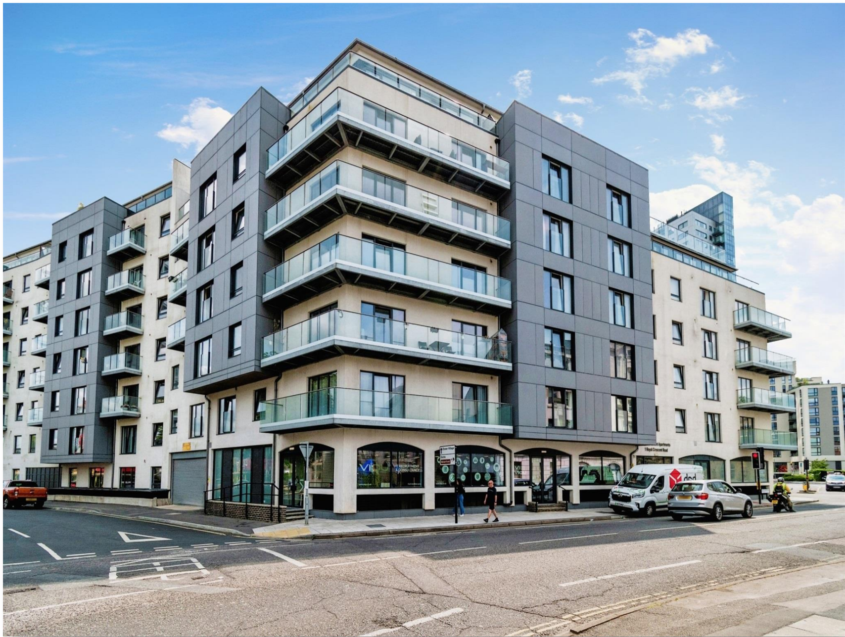
Royal Crescent Apartments Royal Crescent Road, Southampton SO14 3AD