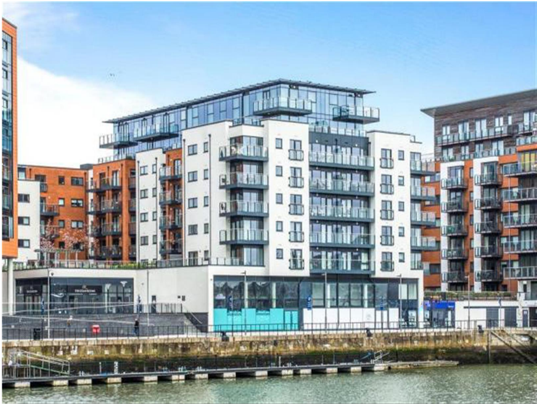
The Blake Building Ocean Way, Southampton SO14 3LN