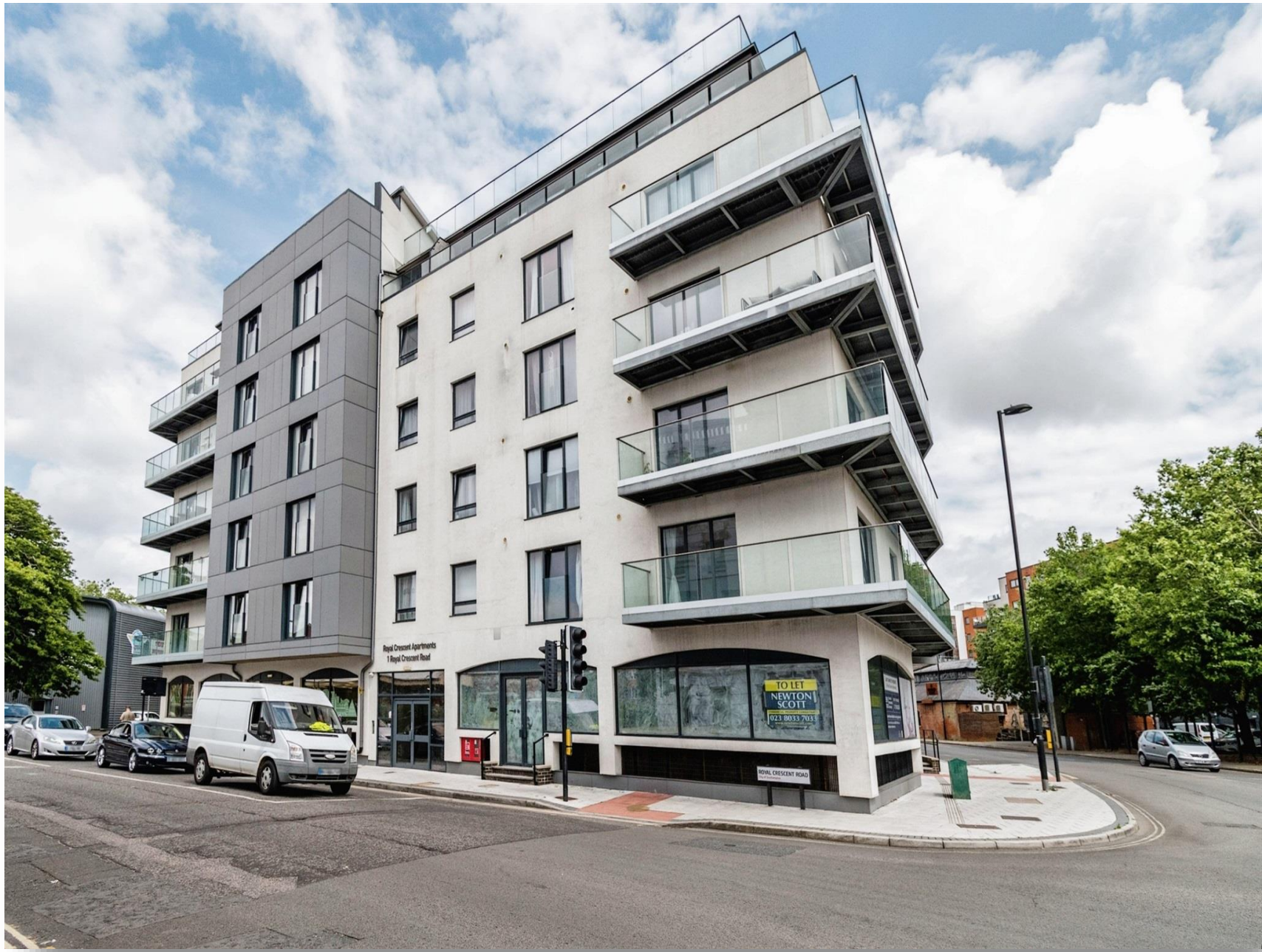
Royal Crescent Apartment Royal Crescent Road, Southampton SO14 3AD