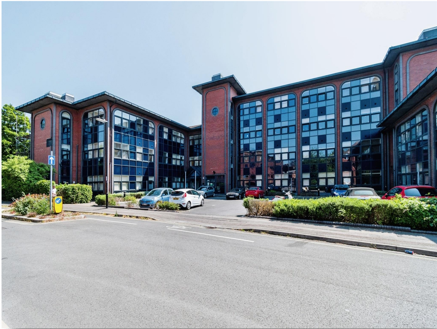
Southbrook Rise Millbrook Road East, Southampton SO15 1BX